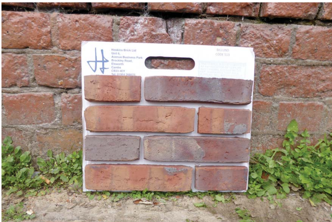
Billund brick adjacent to Interchange building

A sample of this brick will be sent to the Local Planning Authority to accompany this submission.