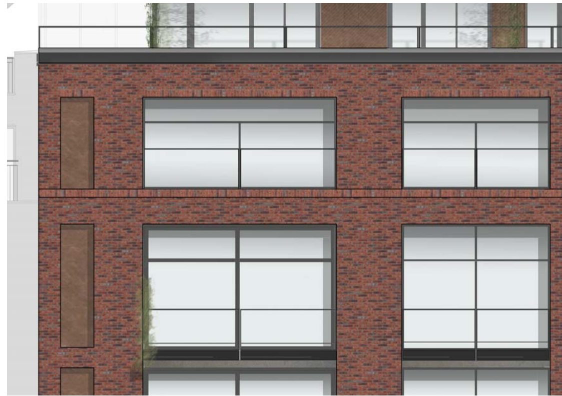
Proposed North Elevation