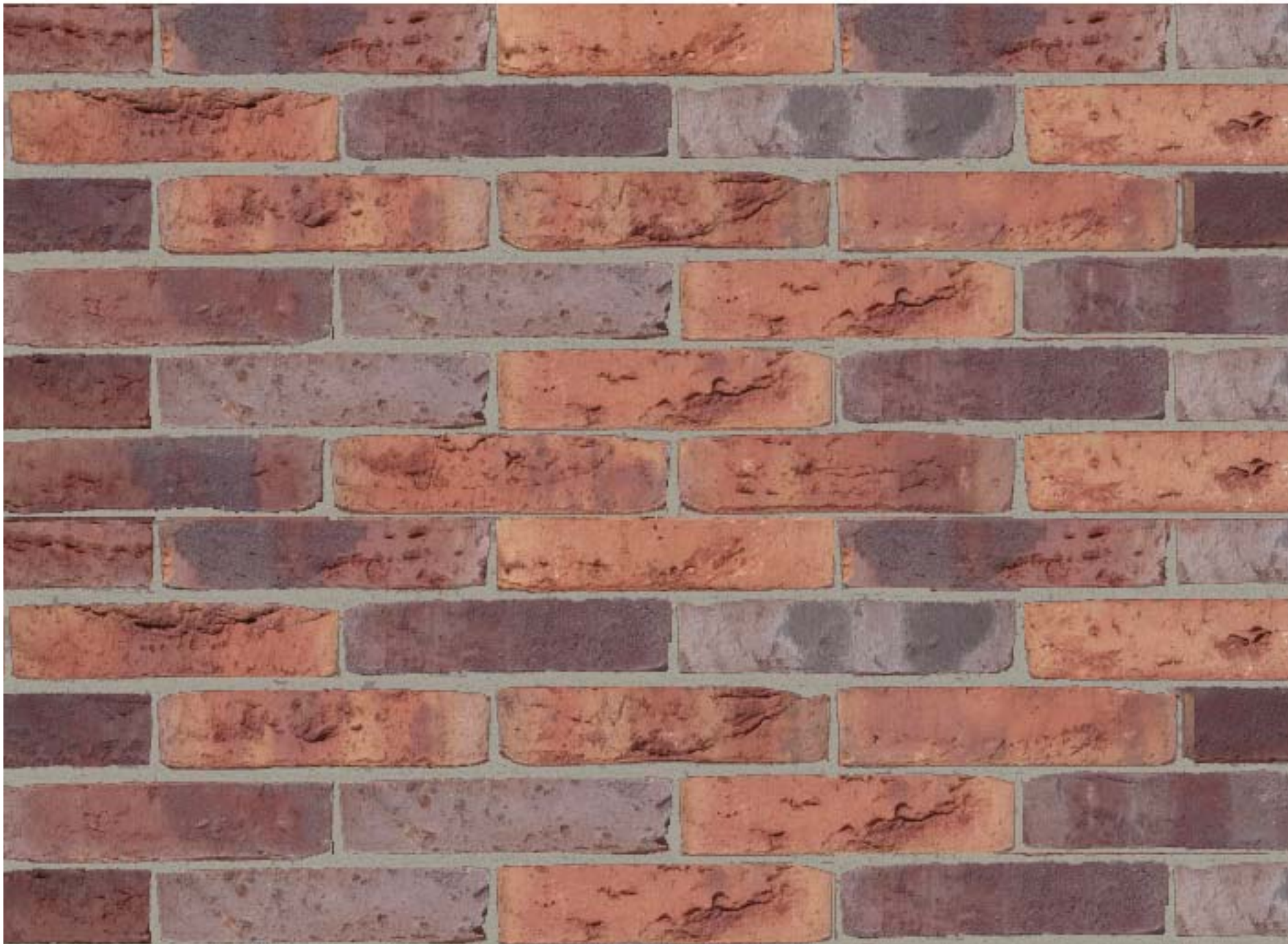
Billund 513 WS brick by Hoskins Brick Ltd with grey mortar to compliment the adjacent Interchange building