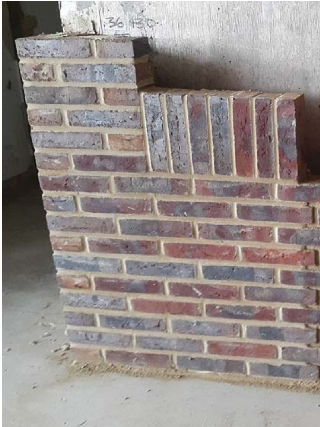
Billund brick adjacent to Interchange building