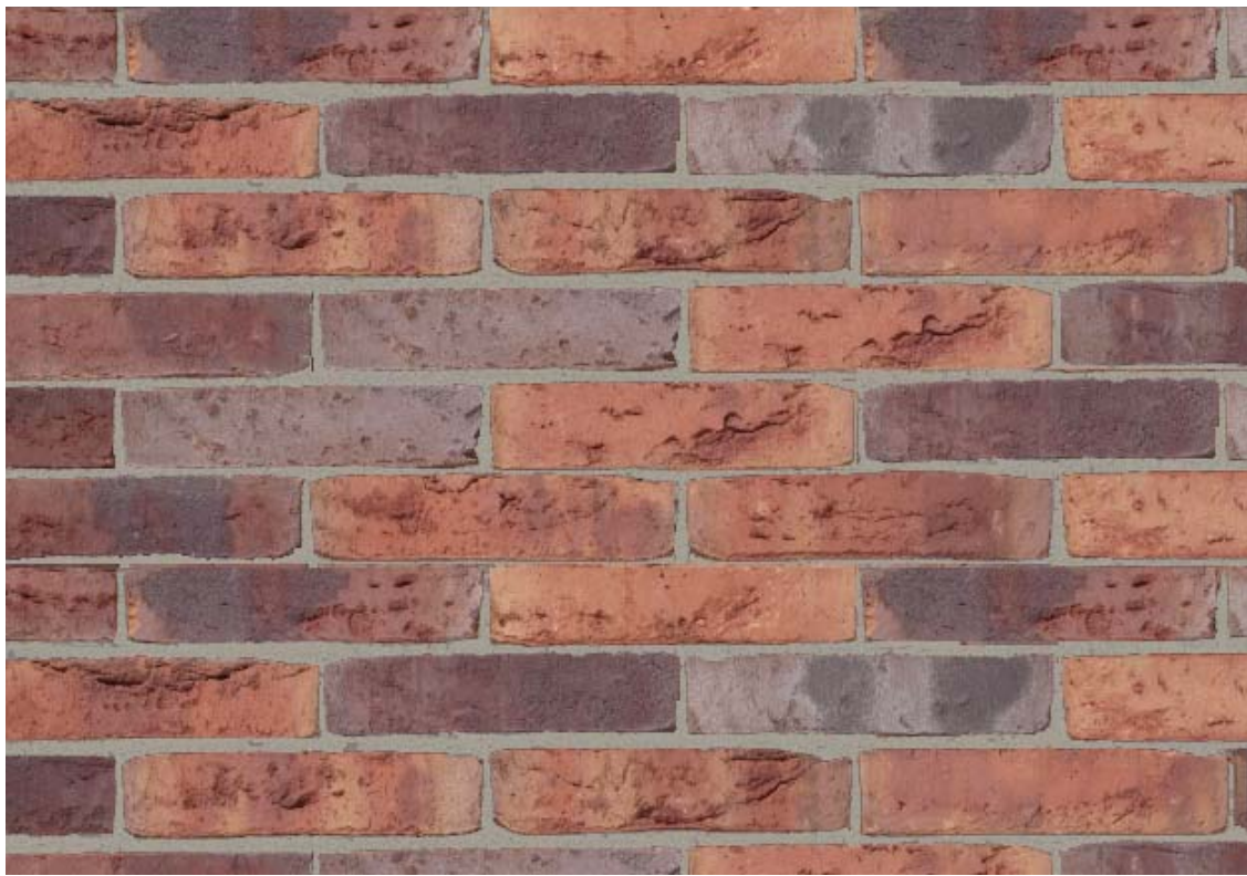
Billund 513 WS brick by Hoskins Brick Ltd with grey mortar to compliment the adjacent Interchange building