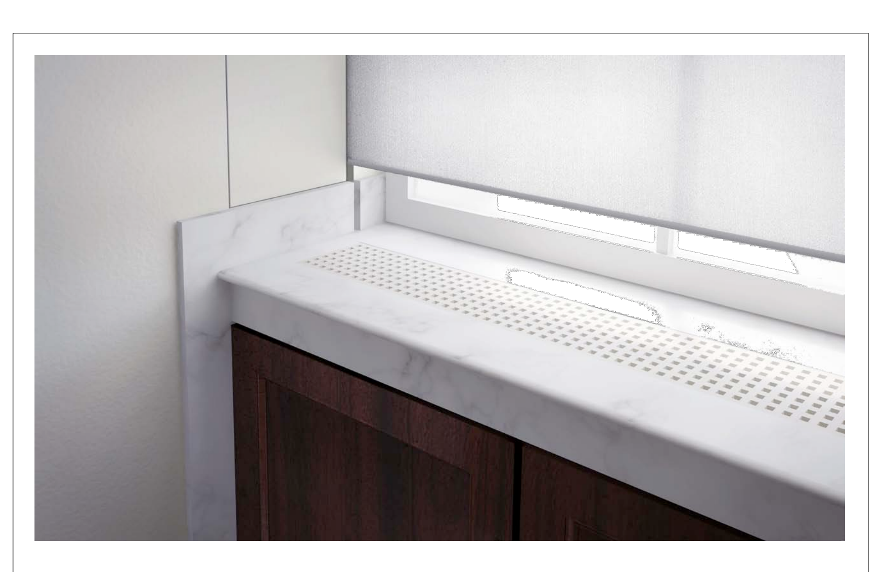
02 Refurbished window cill with ventilation grille detail

Nissen Richards Unit 5-6 Waterhouse 8 Orsman Road London N1 5QJ T 020 7870 8899 info@nissenrichardsstudio.com www.nissenrichardsstudio.com