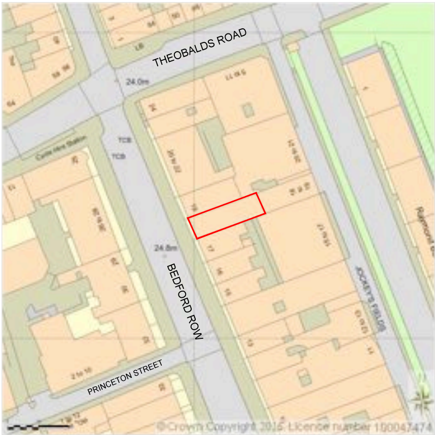
EXISTING LOCATION PLAN