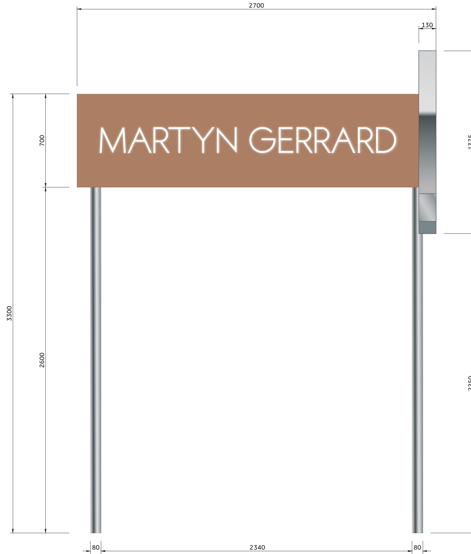
Left Hand Sign - Front Elevation