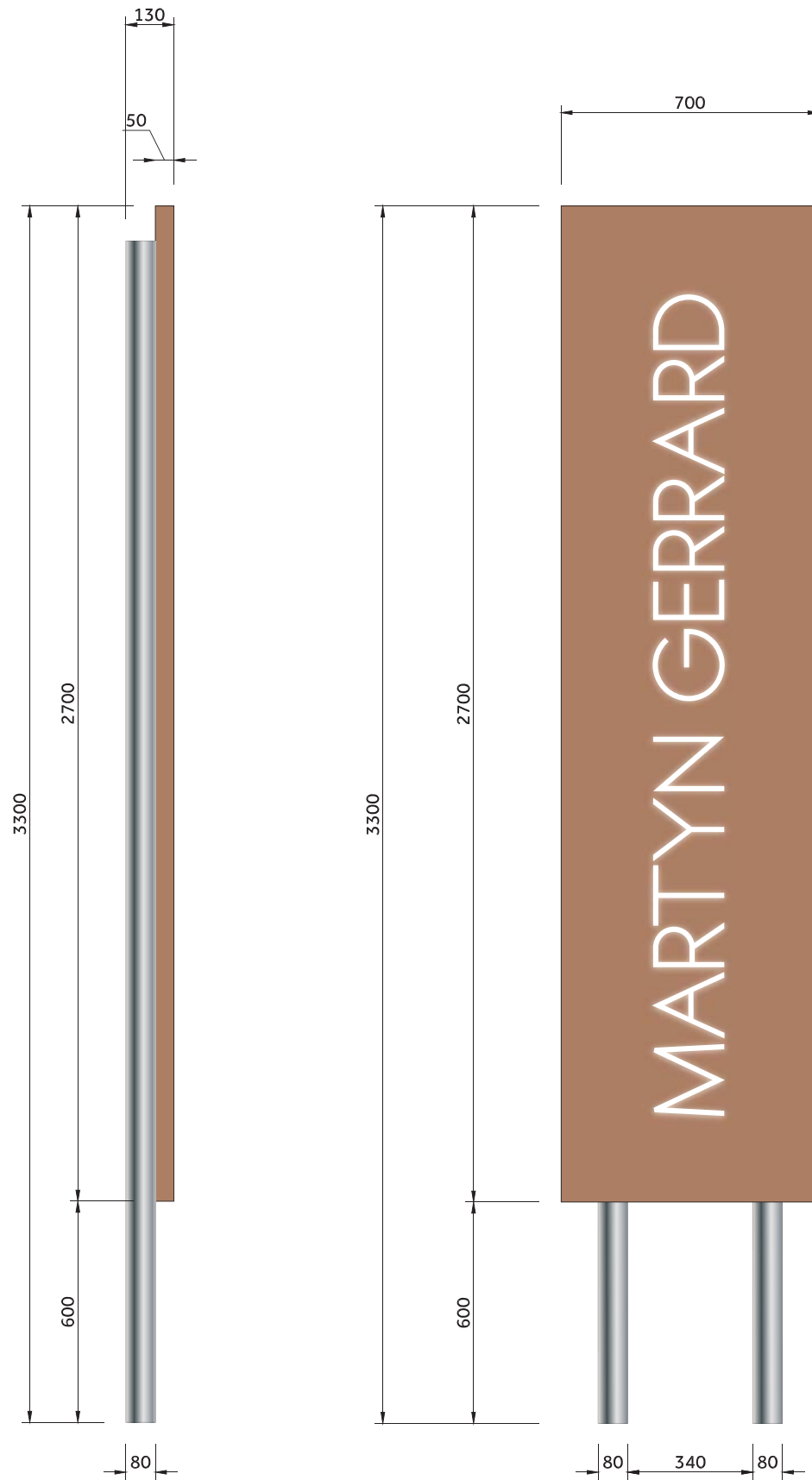
Right Hand Sign - Side Elevation