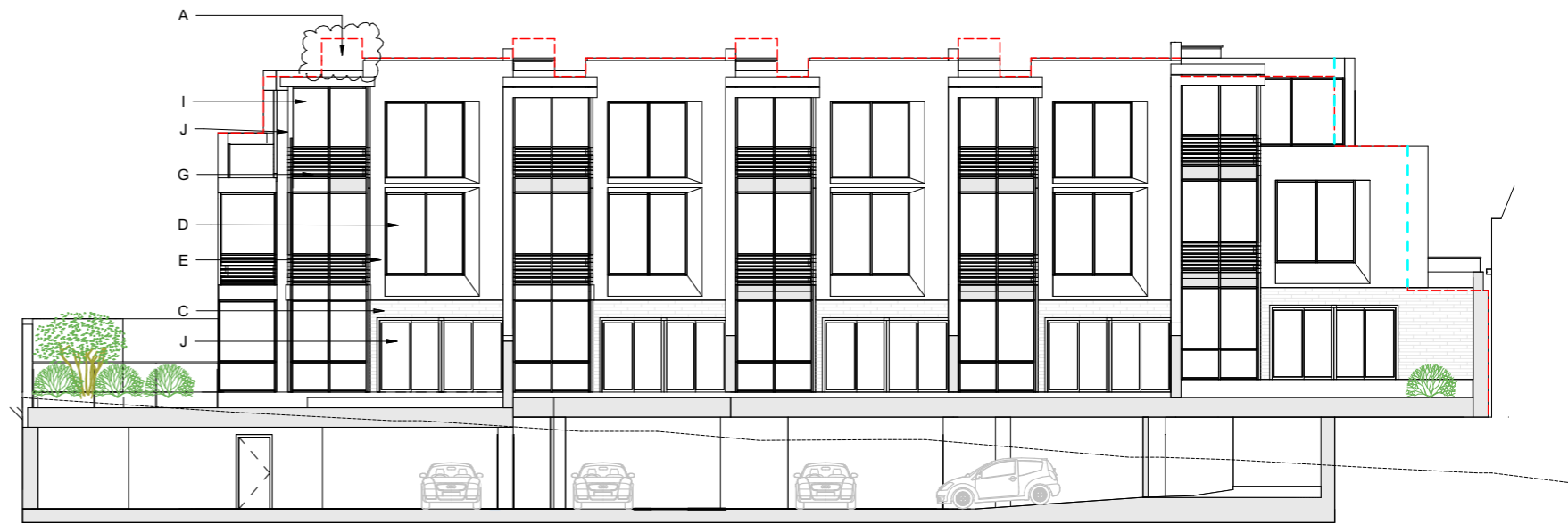
WEST ELEVATION (BACK) PRIVATE GARDENS 1 : 200