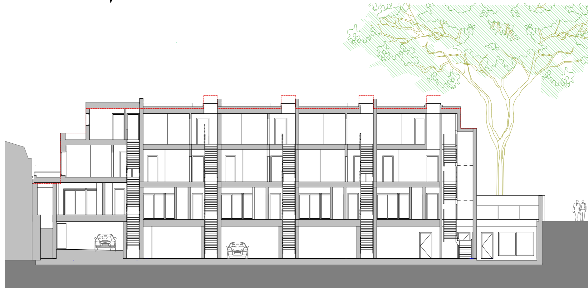
Section AA Scale 1 : 200

Notes: Do not Scale from this drawing Use figured dimensions only