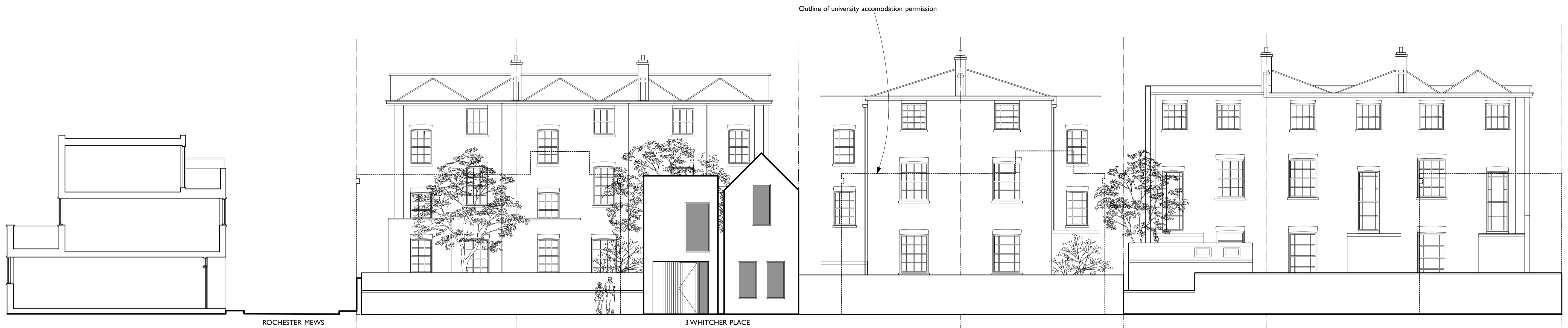
AA PROPOSED SITE FRONT ELEVATION