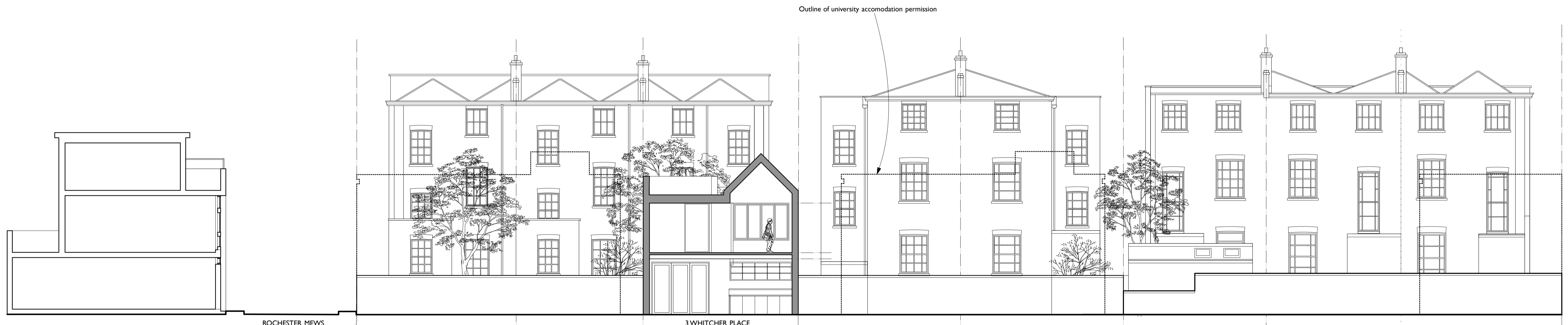
BB PROPOSED SITE SHORT SECTION