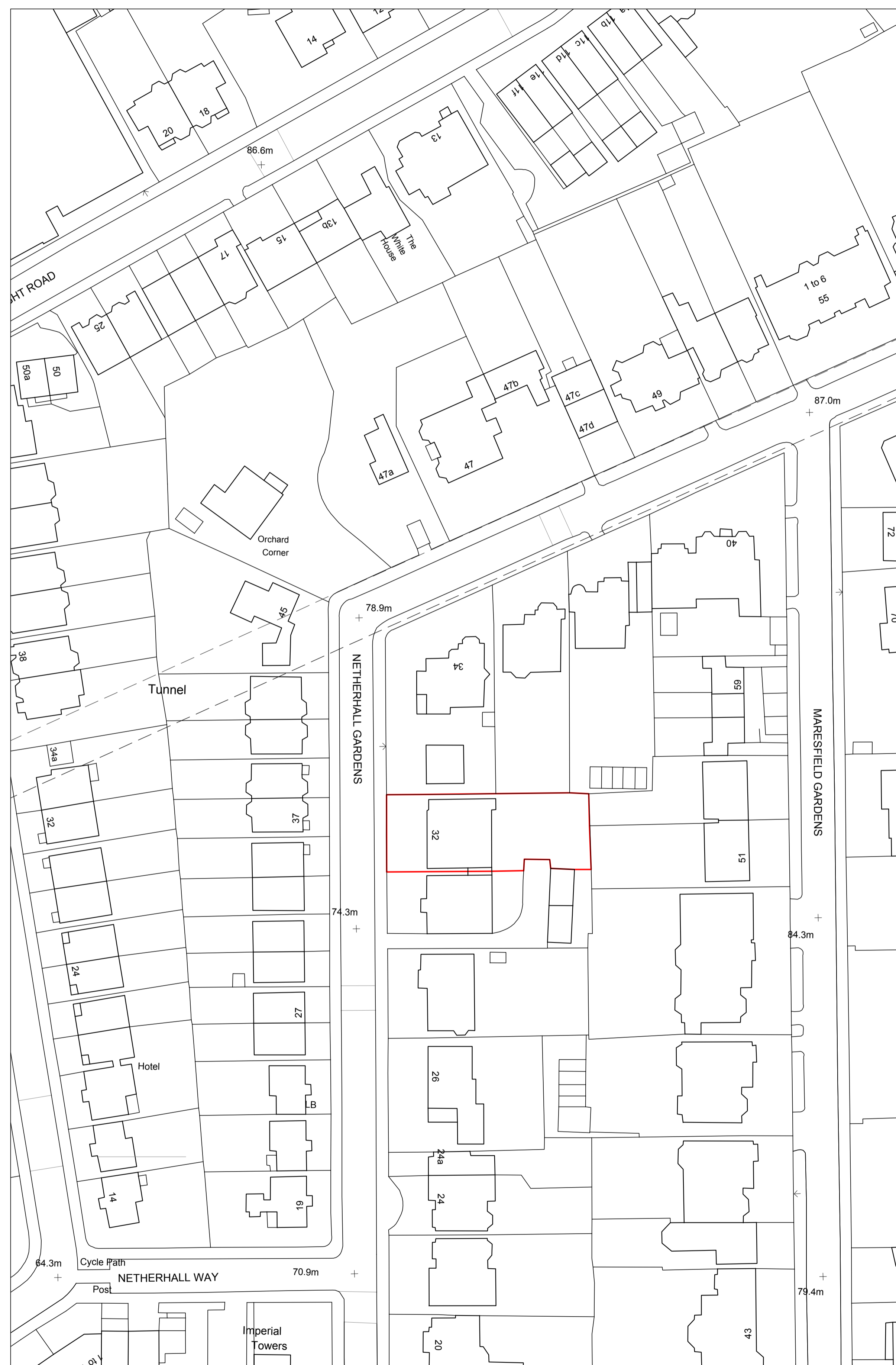
LOCATION PLAN SCALE 1:1250@A3 LP-01