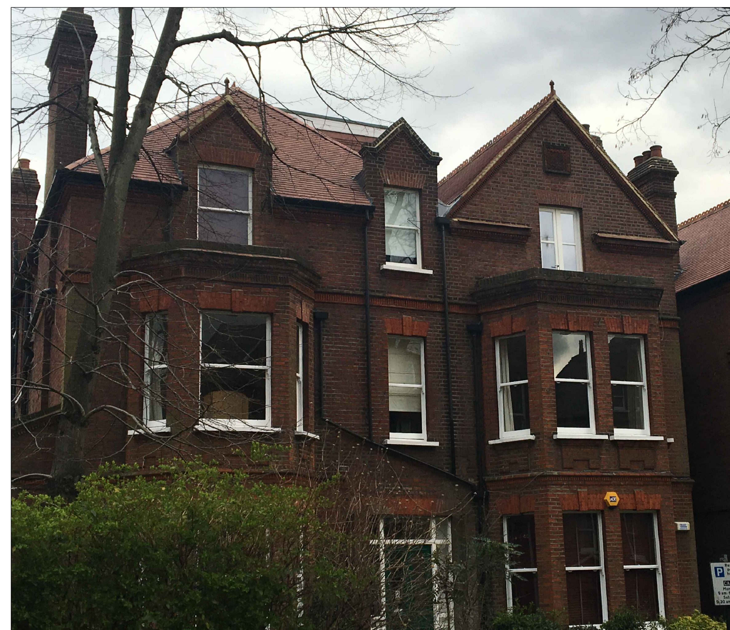
EXISTING PHOTO SCALE 1:NA@A3 LP-01