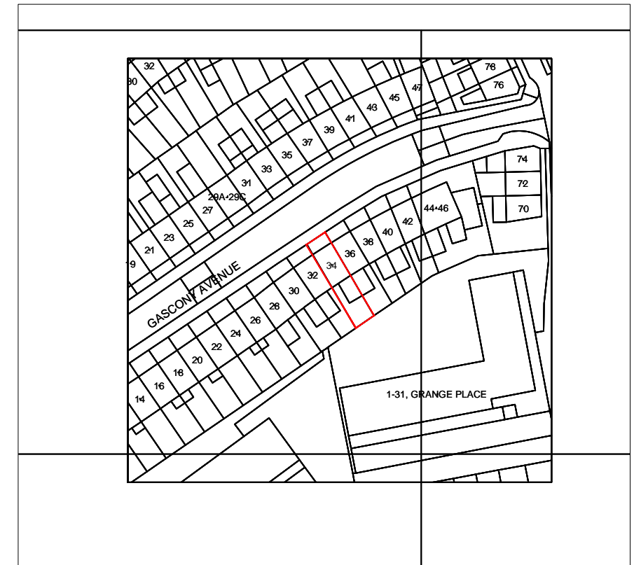
LOCATION PLAN Scale: 1:1250

NOTE: - All dimensions in this drawings are metric.