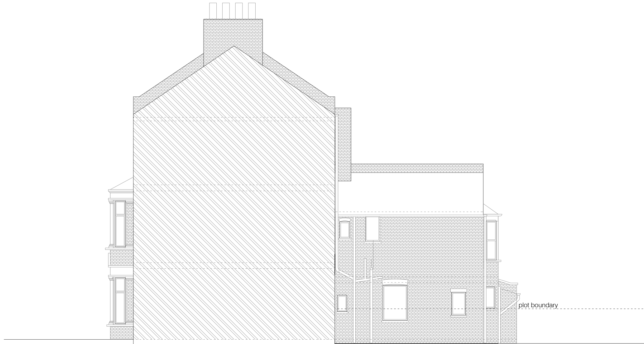
SIDE ELEVATION E: 1/100