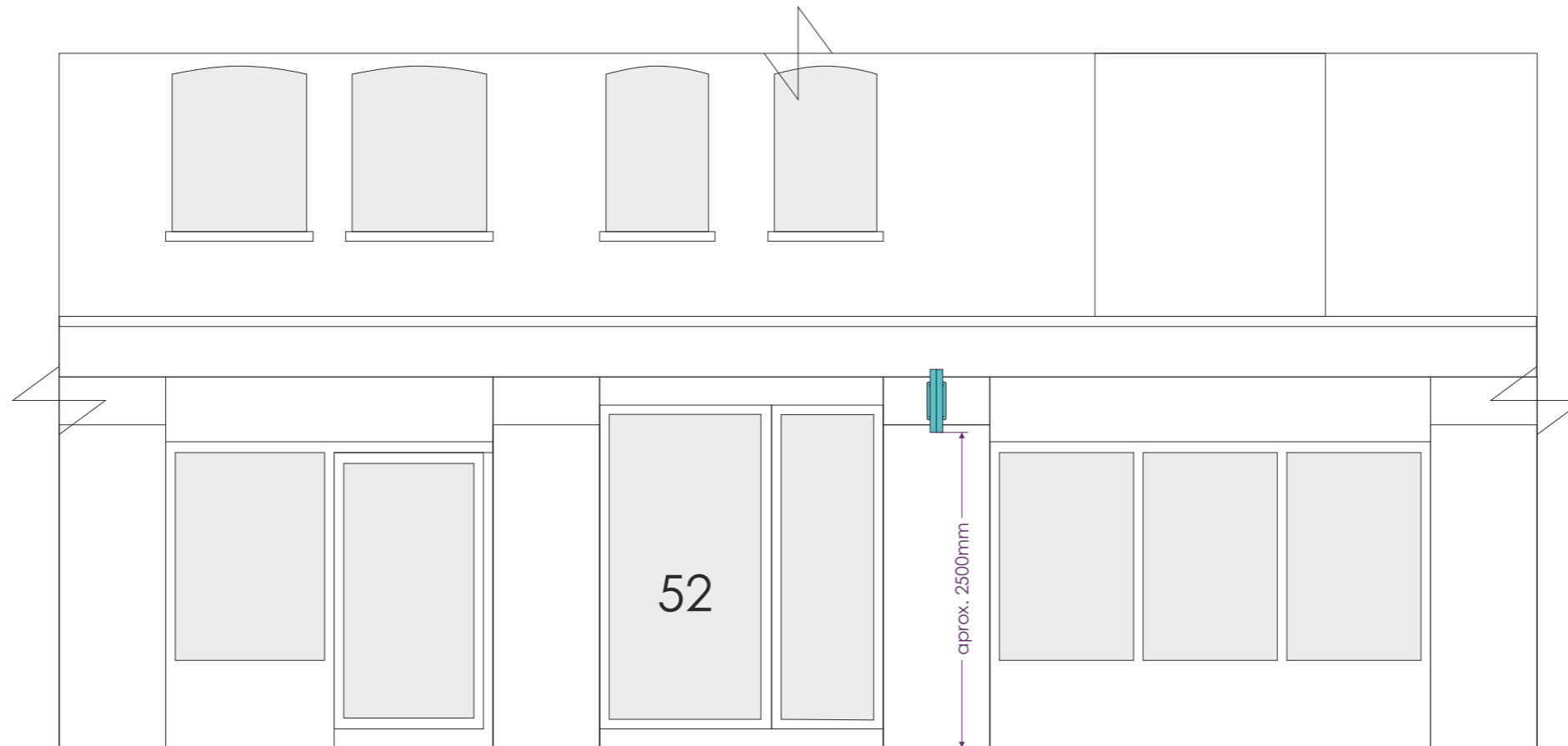
PROJECTOR LOCATION Scale 1:50