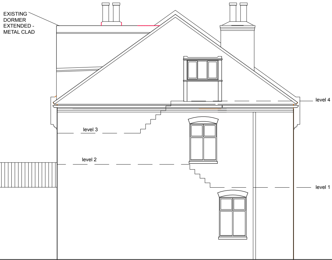
SIDE ELEVATION Scale 1:100@A3

note: ALL PROPOSALS SUBJECT TO PLANNING PROPOSALS SUBJECT TO BUILDING REGULATIONS DO NOT SCALE FROM THIS DRAWING THE INFORMATION CONTAINED IN THIS DRAWING IS ONLY FOR THE PURPOSES AS STATED IN THE TITLE BLOCK. NOT FOR CONSTRUCTION UNLESS STATED COPYRIGHT IS OWNED BY TO NICHOLAS WILLIAMS