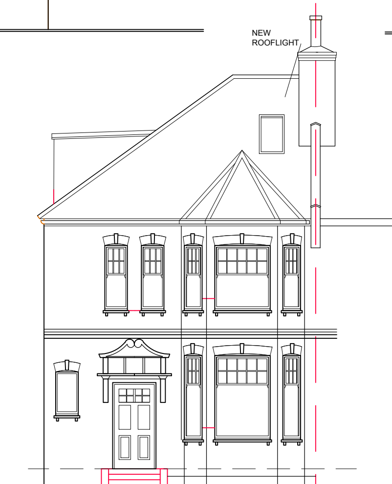
MINSTER ROAD ELEVATION Scale 1:100@A3