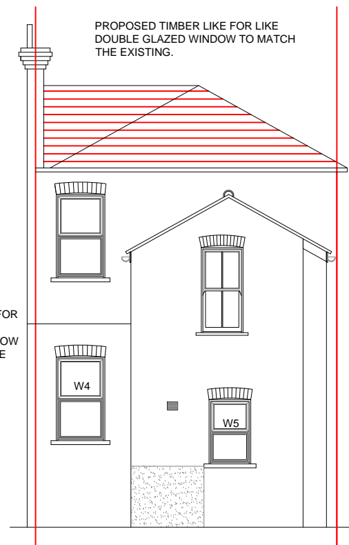
REAR ELEVATION (PROPOSED)

The proposals are for replacement of the existing timber windows at the front, rear and side of the property.