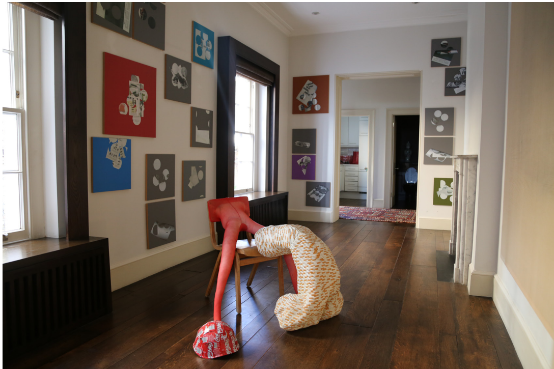
Annex ground floor kitchen and mezzanine