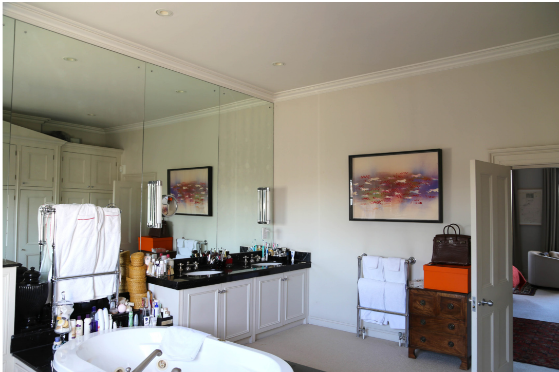
Second floor master bedroom and master bathroom