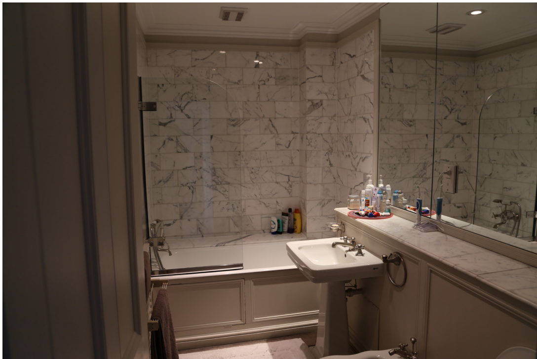
Third floor bedroom and bathroom A