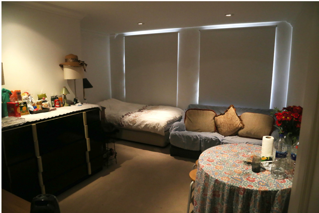
10 Gloucester Gate Mews garage and first floor