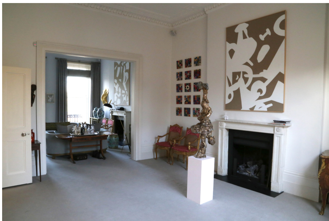
First floor drawing rooms west and east showing opening between rooms