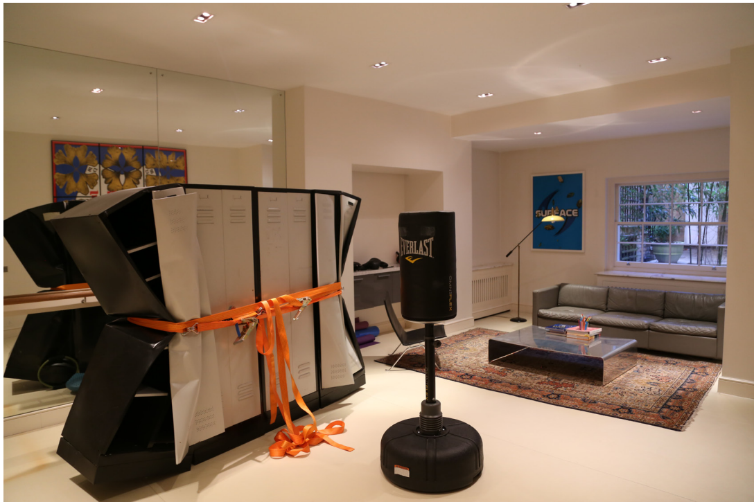
Lower ground floor hallway and east facing room