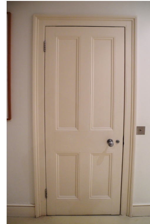
PD B1 03