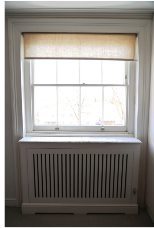
EW 03 02