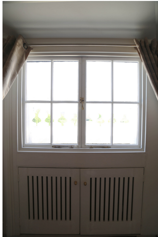
EW 03 01