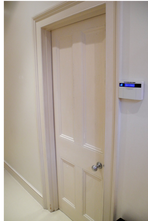
PD B1 01