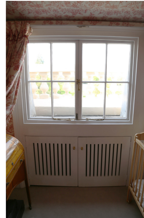
EW 03 04