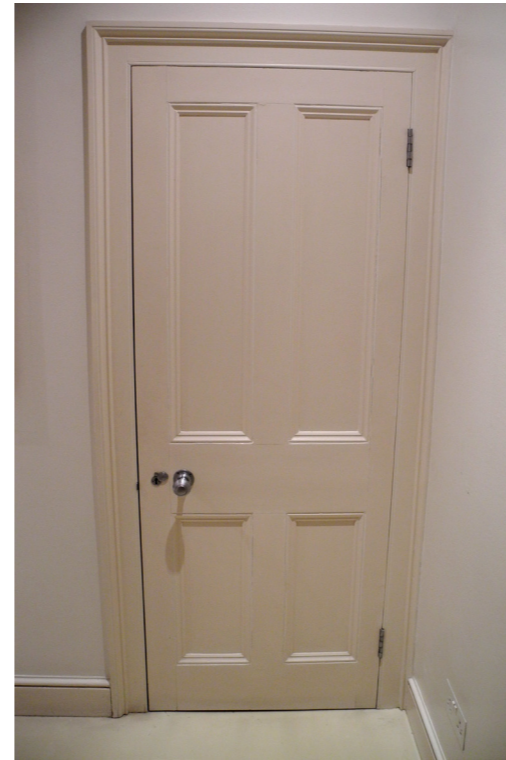
PD B1 02