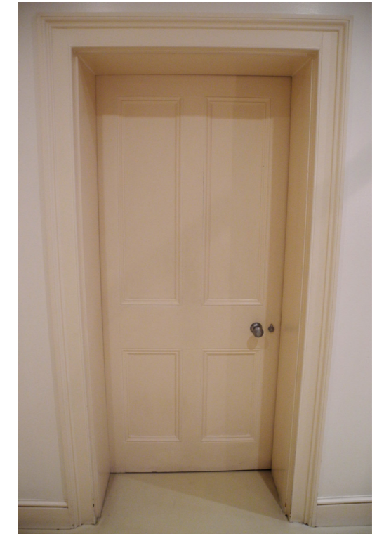
PD B1 04