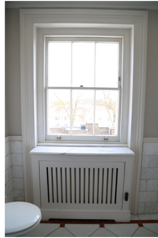
EW 03 03