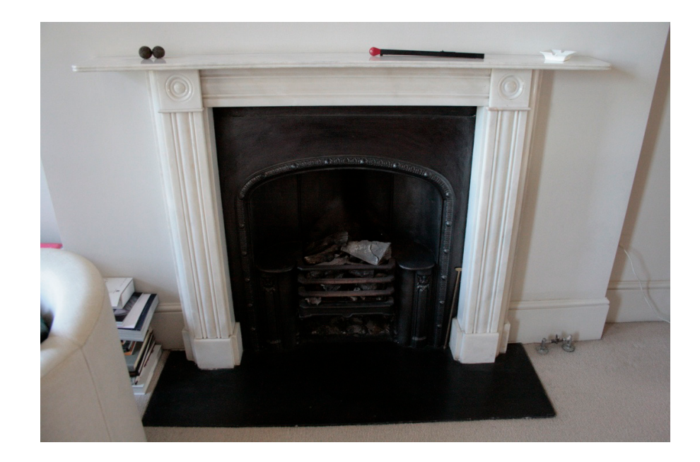
FP 02 01