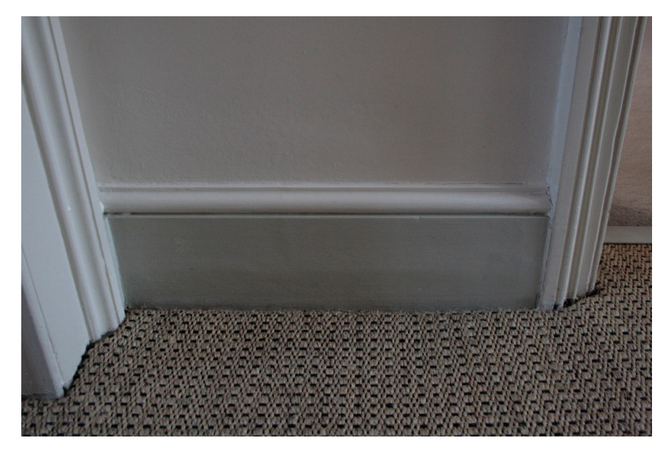
Type D skirting

To be retained, carefully repaired and repainted