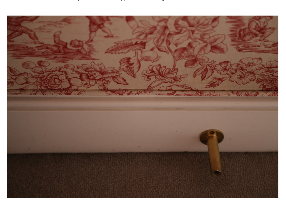
Type D skirting

To be removed and replaced with type E skirting