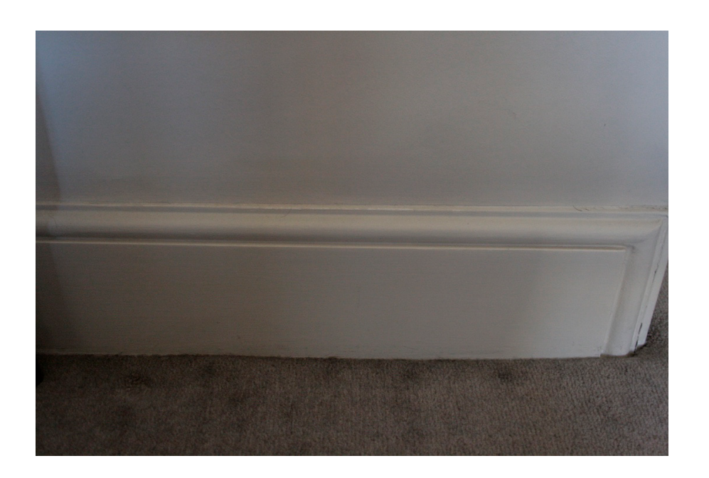
Type D skirting