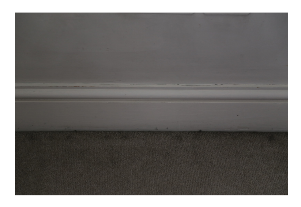
Type D skirting

To be retained, carefully repaired and repainted