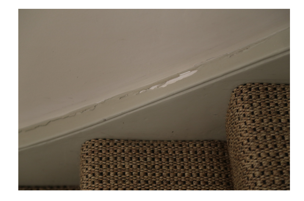
Type E skirting