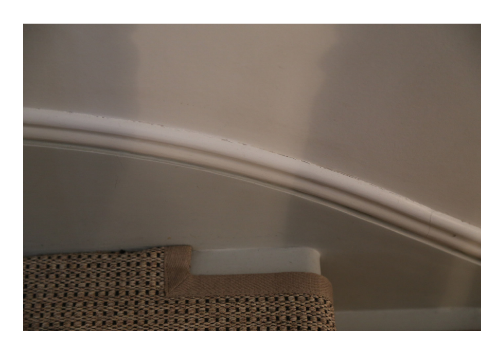
Type A skirting

To be retained, carefully repaired and repainted