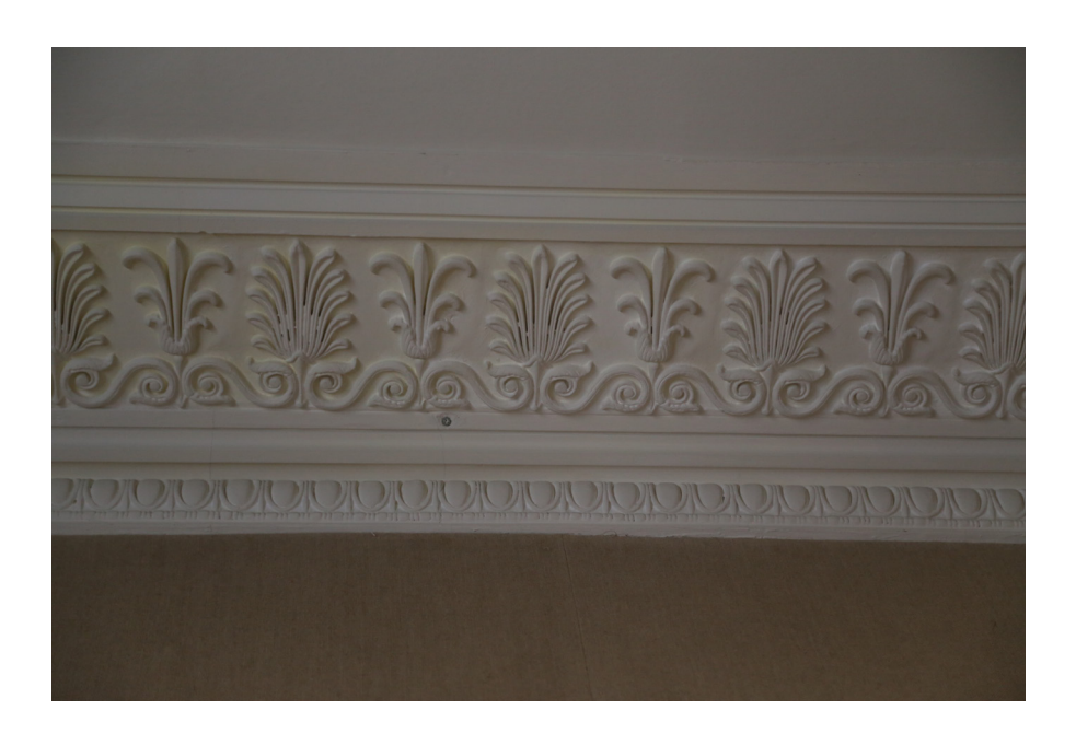
Type B cornice

To be retained, carefully repaired and repainted