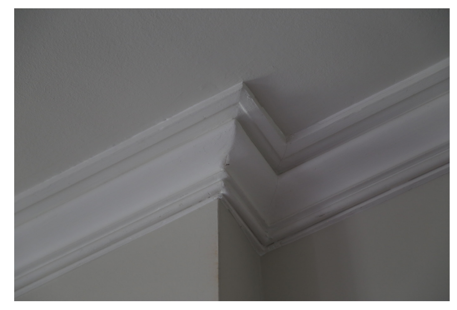
Type D cornice