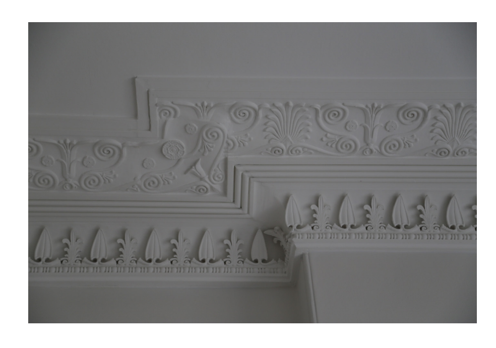
Type C cornice

To be retained, carefully repaired and repainted