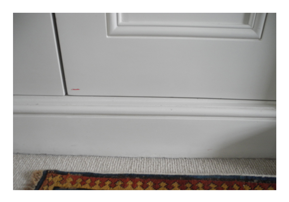
Type D skirting

To be retained, carefully repaired and repainted