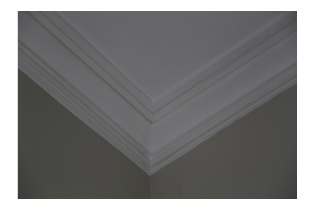
Type D cornice

To be retained, carefully repaired and repainted