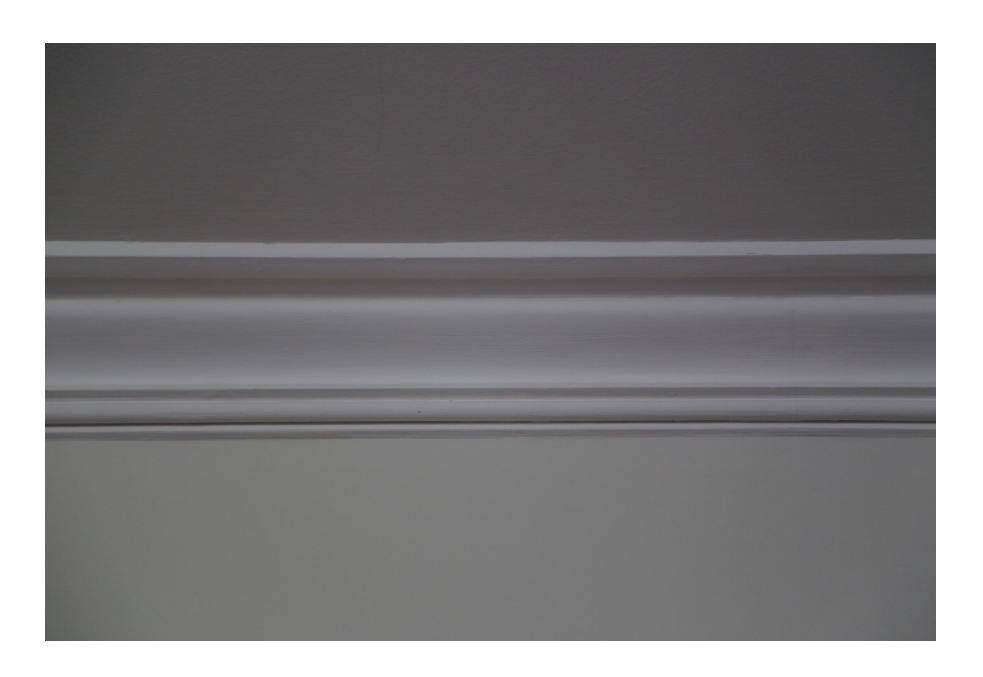
Type D cornice

To be retained, carefully repaired and repainted