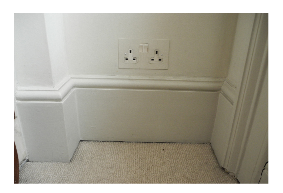
Type D skirting

To be retained, carefully repaired and repainted