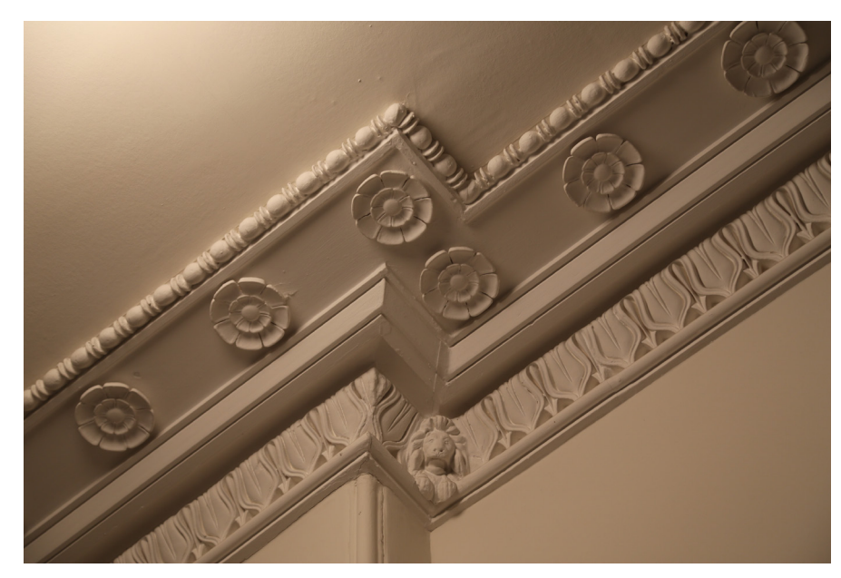
Type A cornice