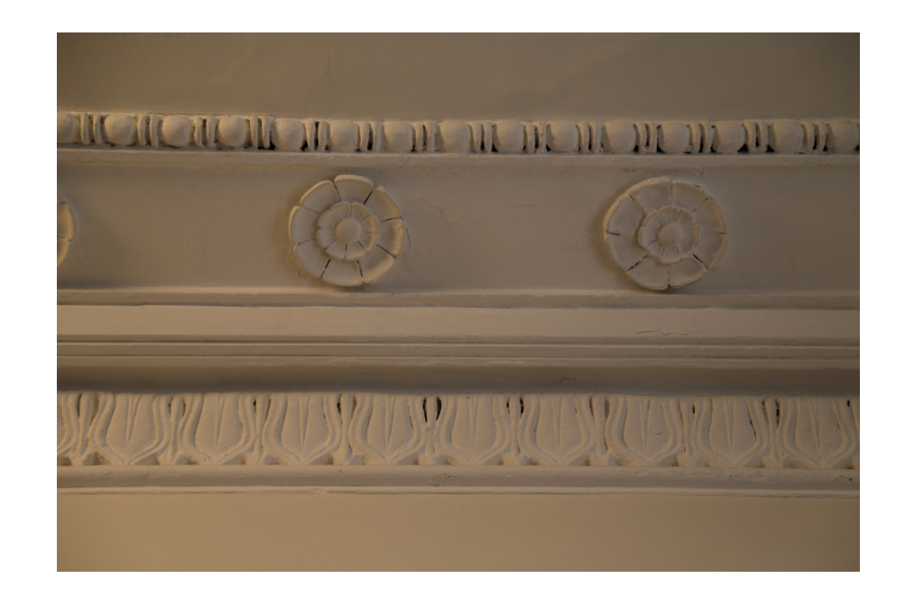
Type A cornice