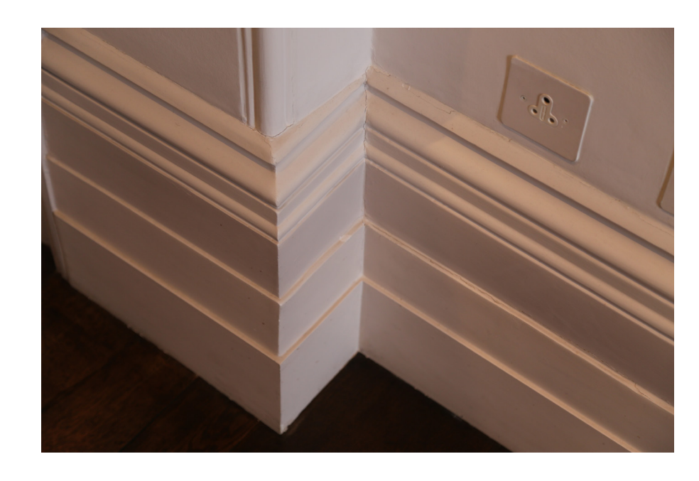
Type B skirting

To be retained, carefully repaired and repainted