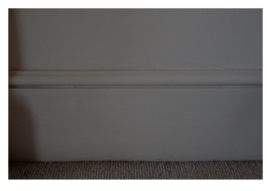
Type D skirting