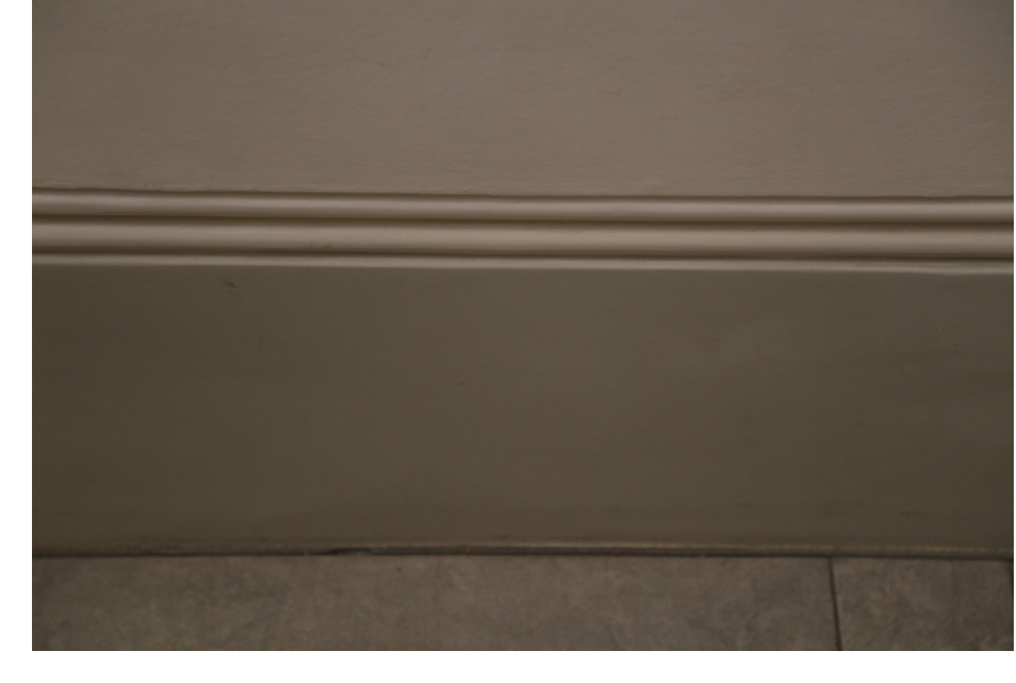
Type A skirting