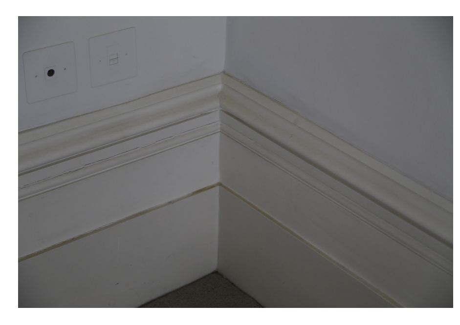
Type C skirting

To be retained, carefully repaired and repainted