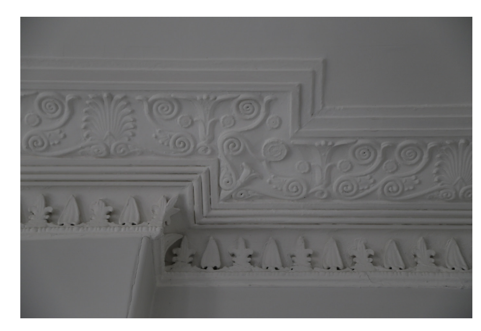
Type C cornice

To be retained, carefully repaired and repainted