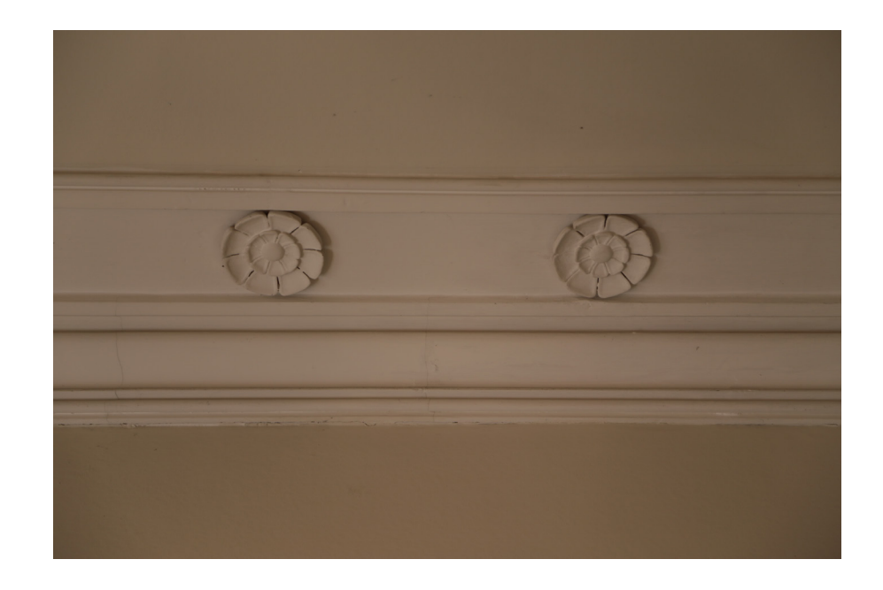
Type A cornice