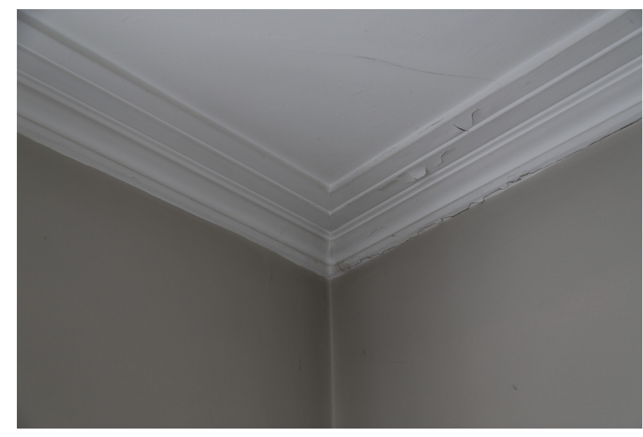
Type E cornice