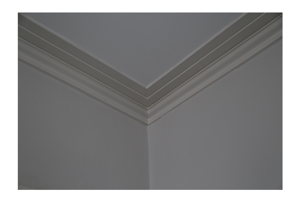
Type E cornice