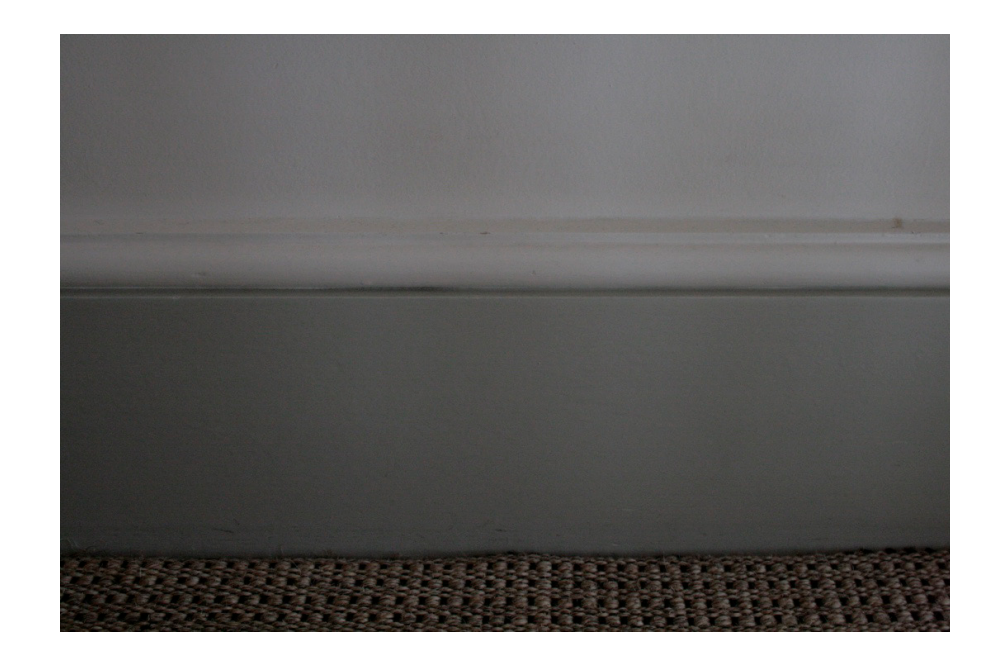
Type D skirting