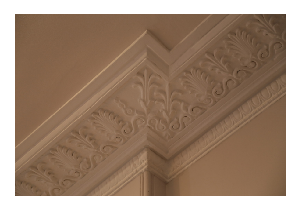
Type B cornice

To be retained, carefully repaired and repainted