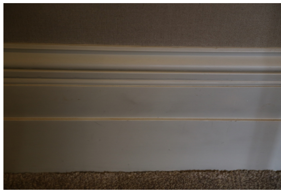
Type B skirting

To be retained, carefully repaired and repainted