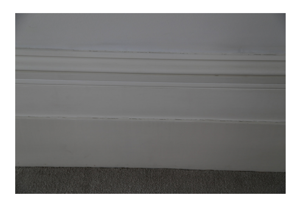
Type C skirting