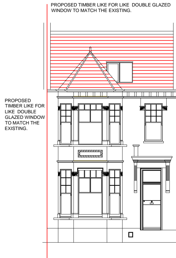
FRONT ELEVATION (PROPOSED)