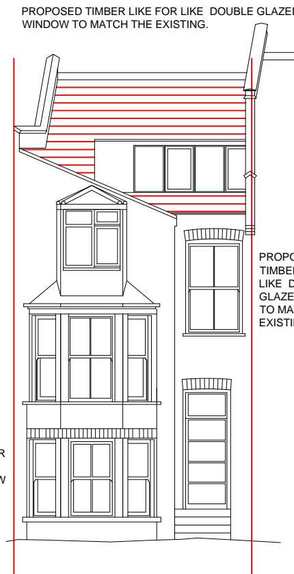
REAR ELEVATION (PROPOSED)