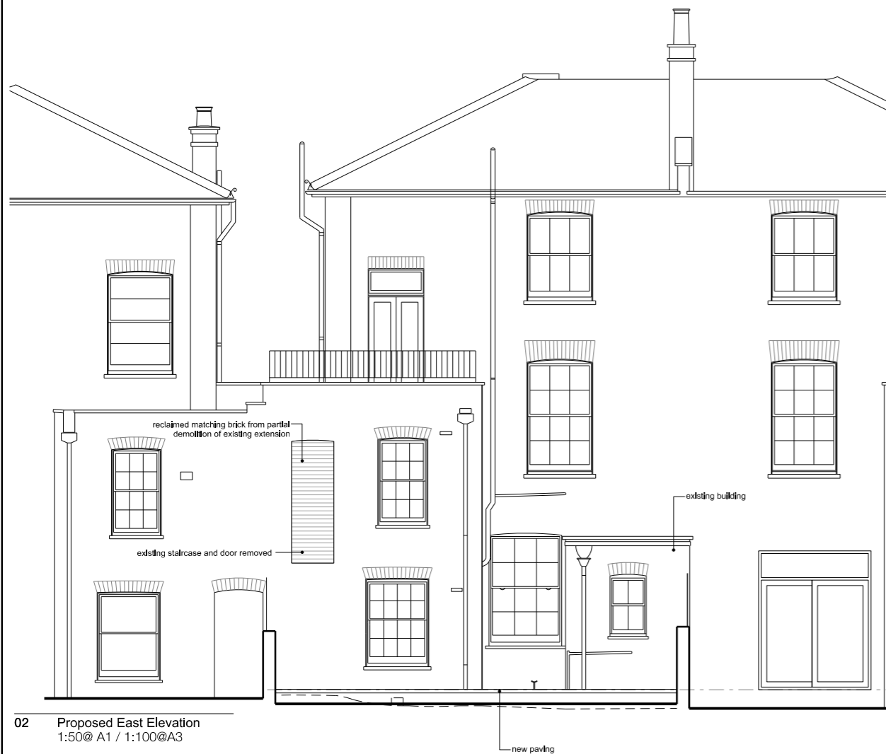
02 Proposed East Elevation 1:50@ A1 / 1:100@A3