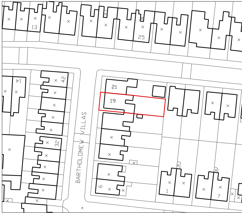
01 Location Plan 1:500@ A3 / 1:1000@A3