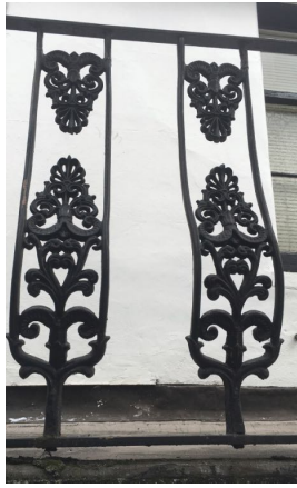
typical ballustrade detail