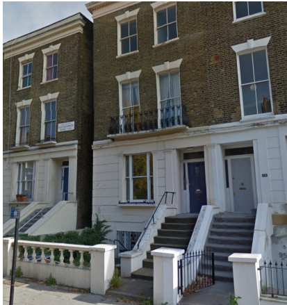
Similar ballustrading at 97 Bartholomew Road