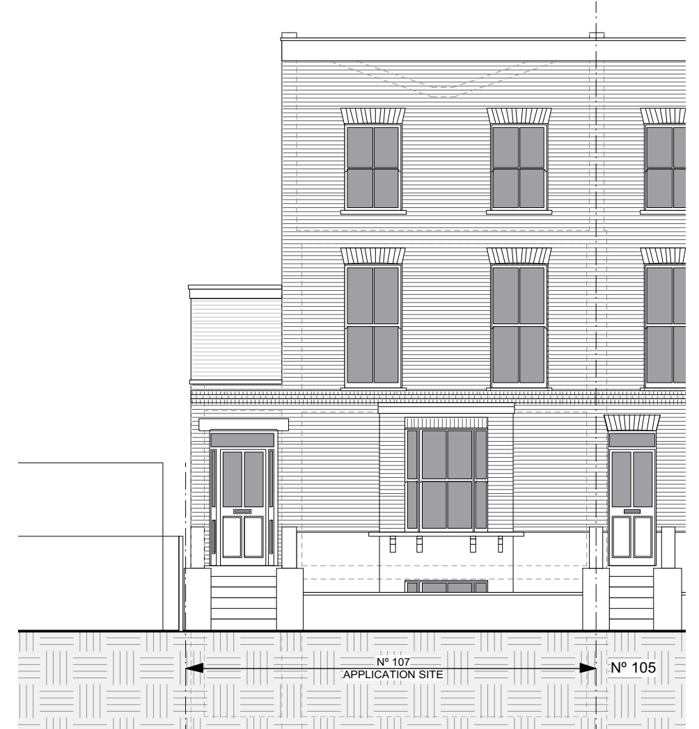
Existing Street Elevation scale 1:100 @ A3