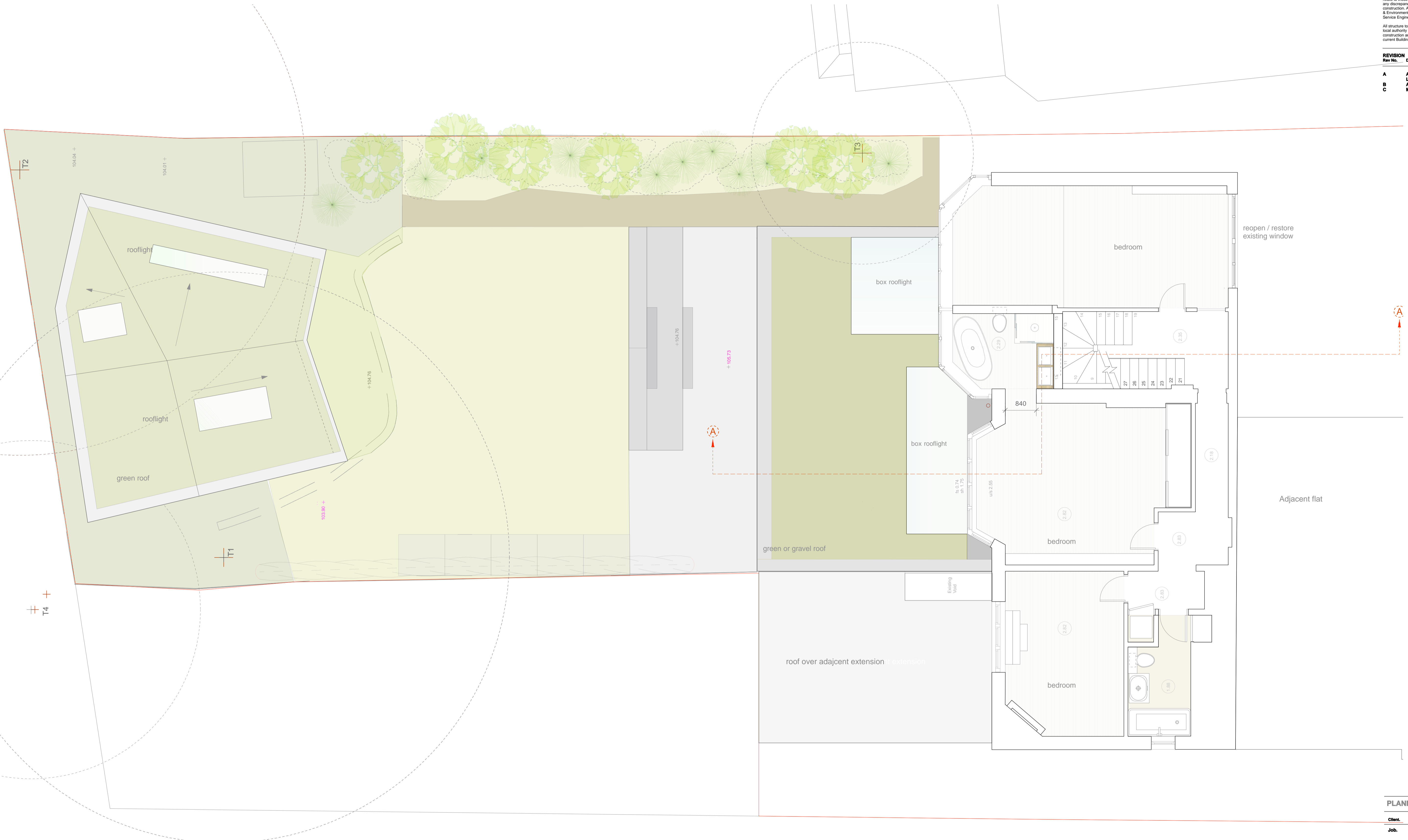
Proposed First Floor Plan 1:50