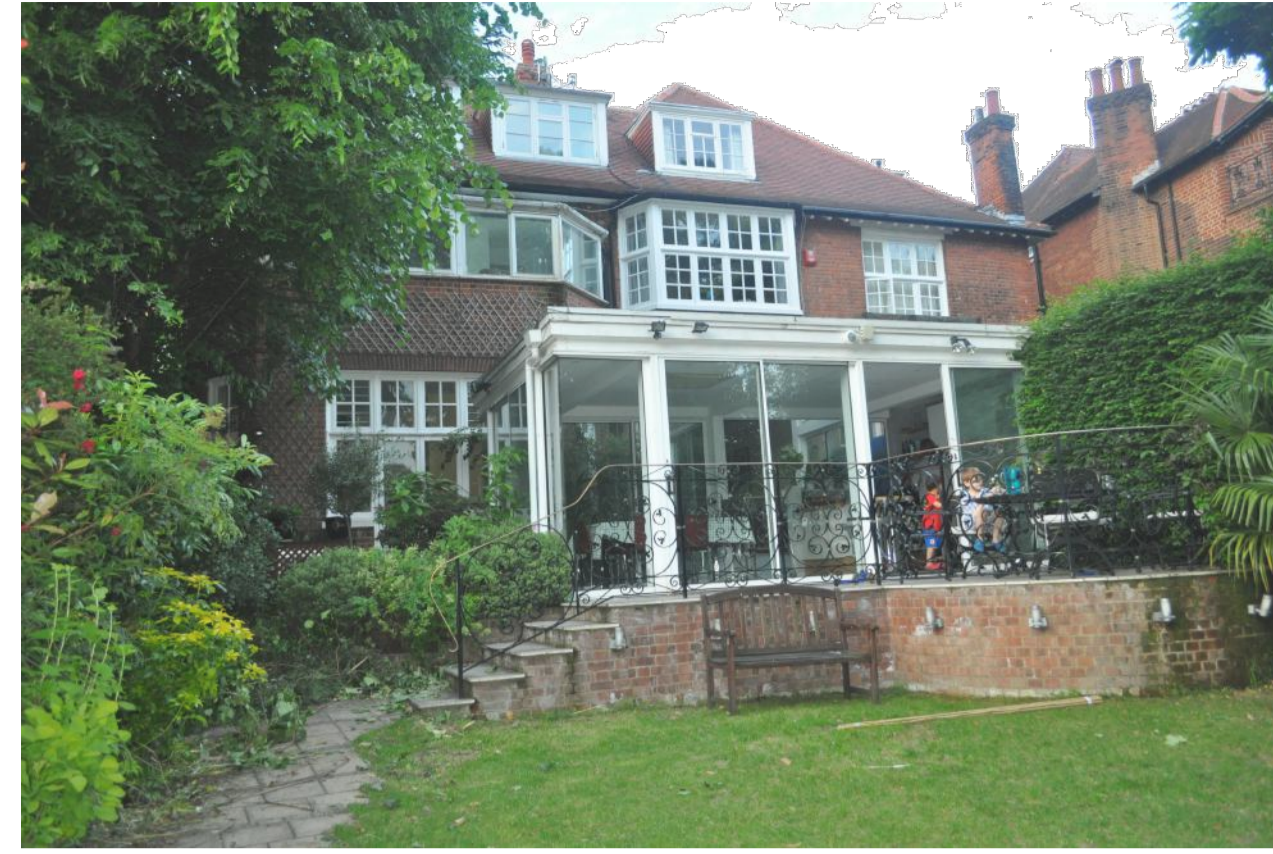
Existing Rear Extension

GENERAL NOTES. The Contractor to advise on all details and ensure stability and strength of construction. The contractor to provide setting out and rod drawings for approval prior to construction. The contractor to check all dimensions on site and relate to these drawings. The contractor to report any discrepancies to designers prior to construction. All services to local authorities, BCO & Environmental Health requirements and to Service Engineers. All structure to Structural Engineer's details and local authority and BCO requirements. All construction and materials to comply with the current Building and Fire Regulations.