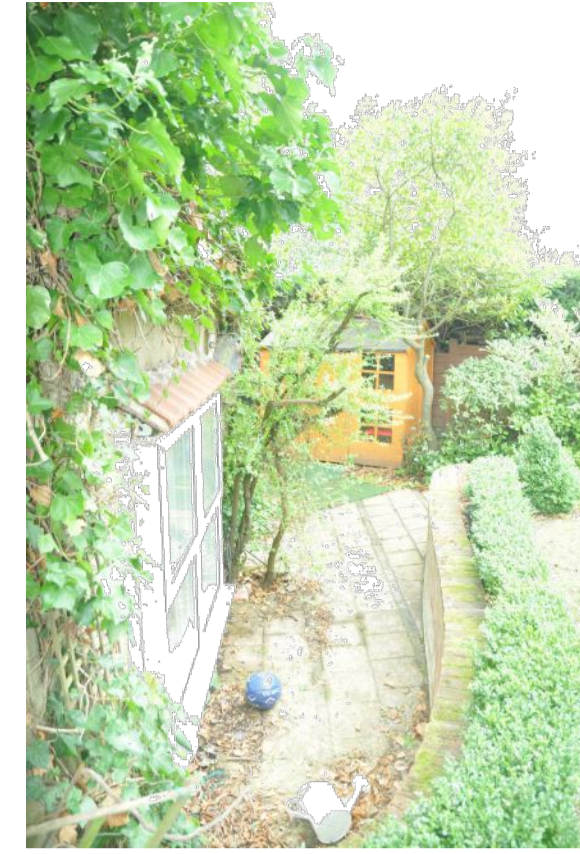
Existing Retaining wall