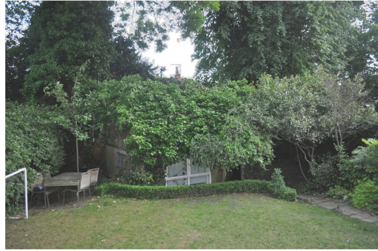
Existing Summer House