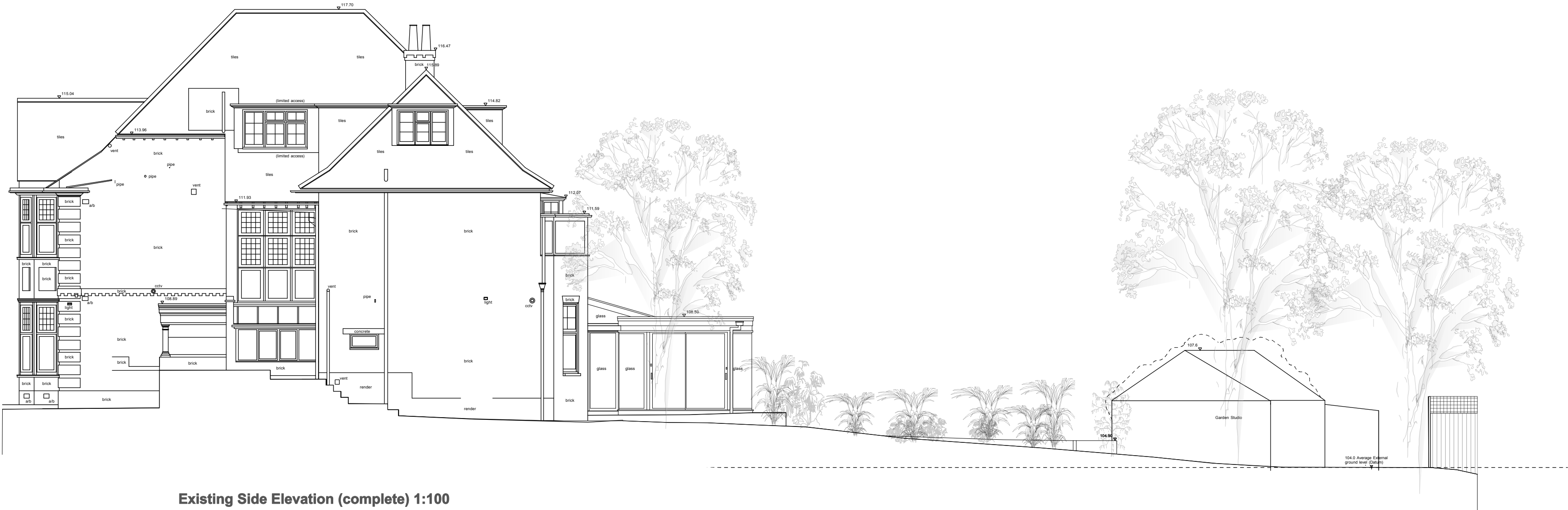
Existing Side Elevation (complete) 1:100