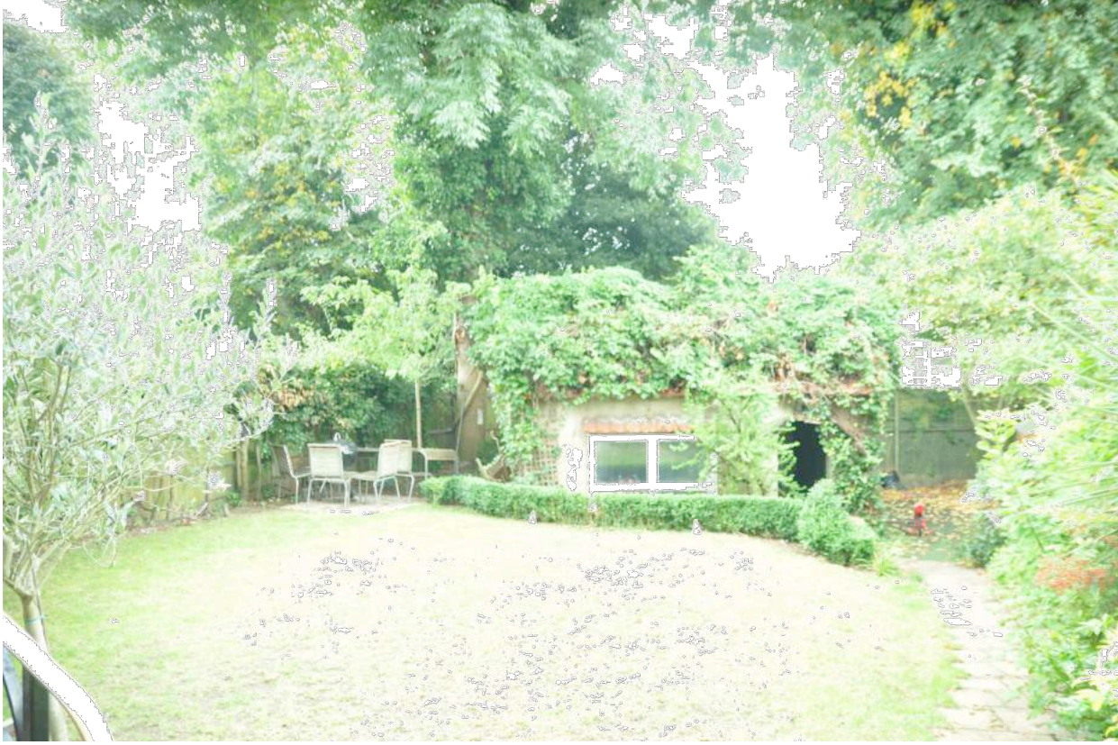
Existing Summer House