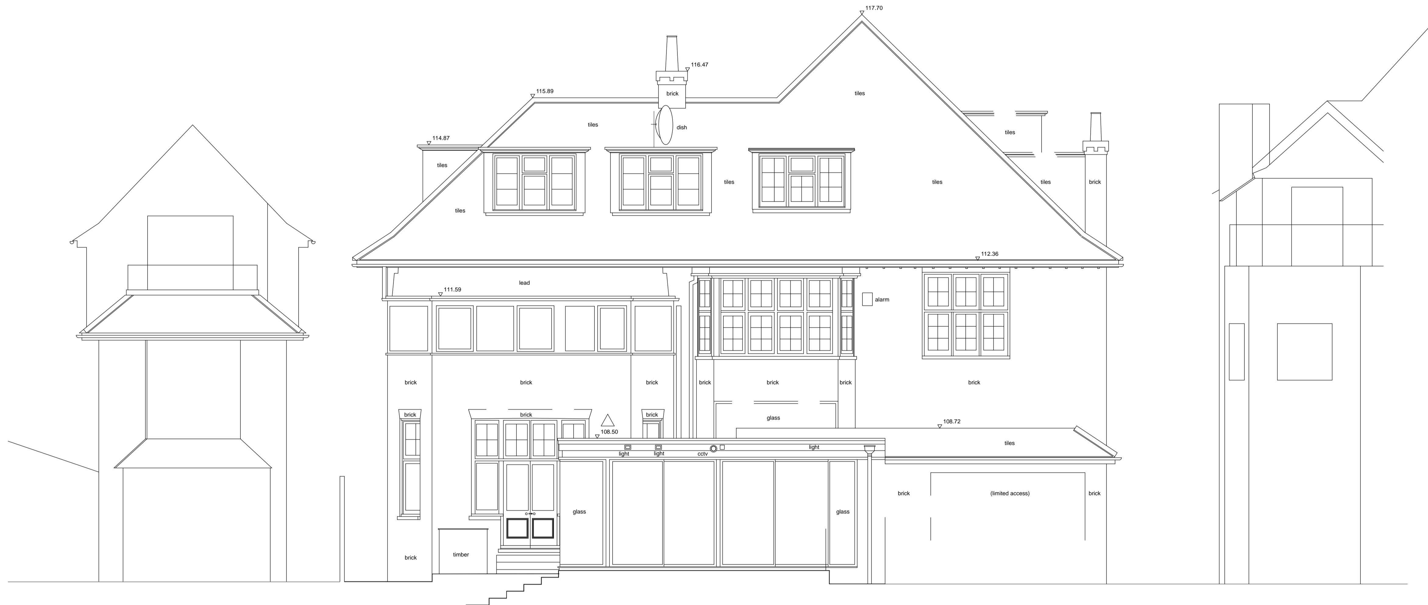
Existing Rear Elevation 1:50