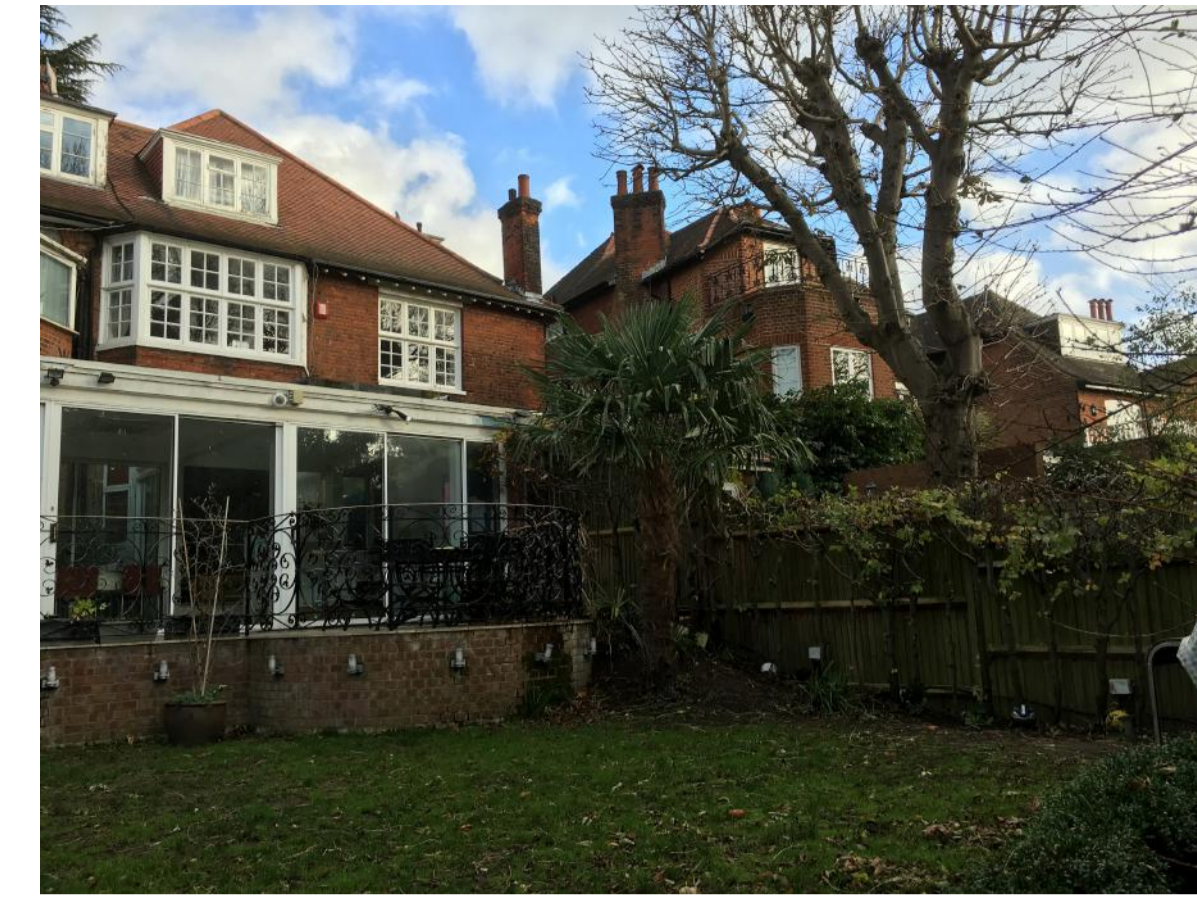
Existing Rear Extension