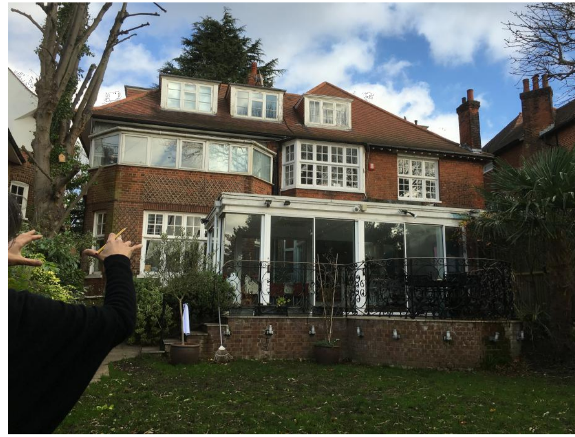
Existing Rear Extension