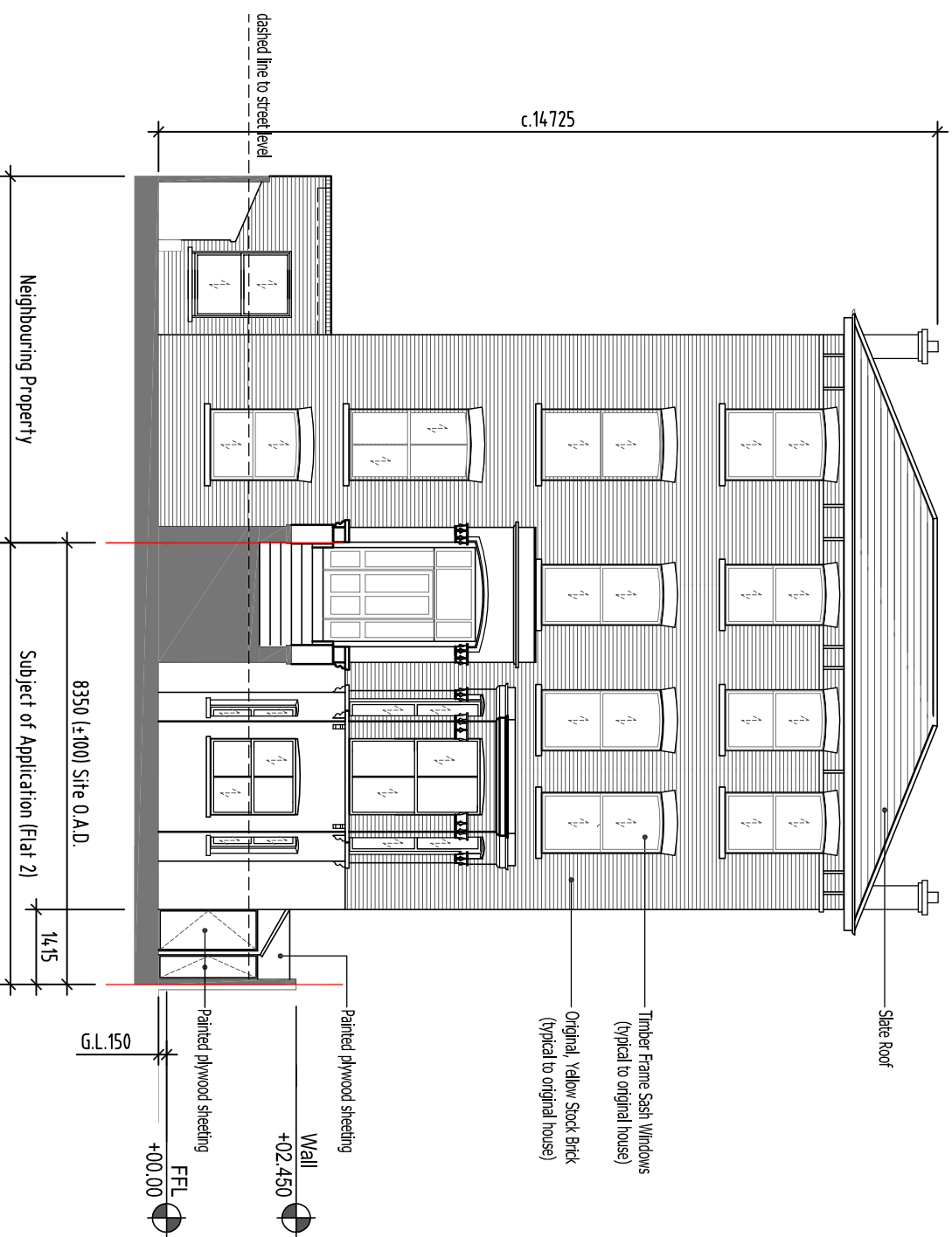
Existing Front Elevation. (West)