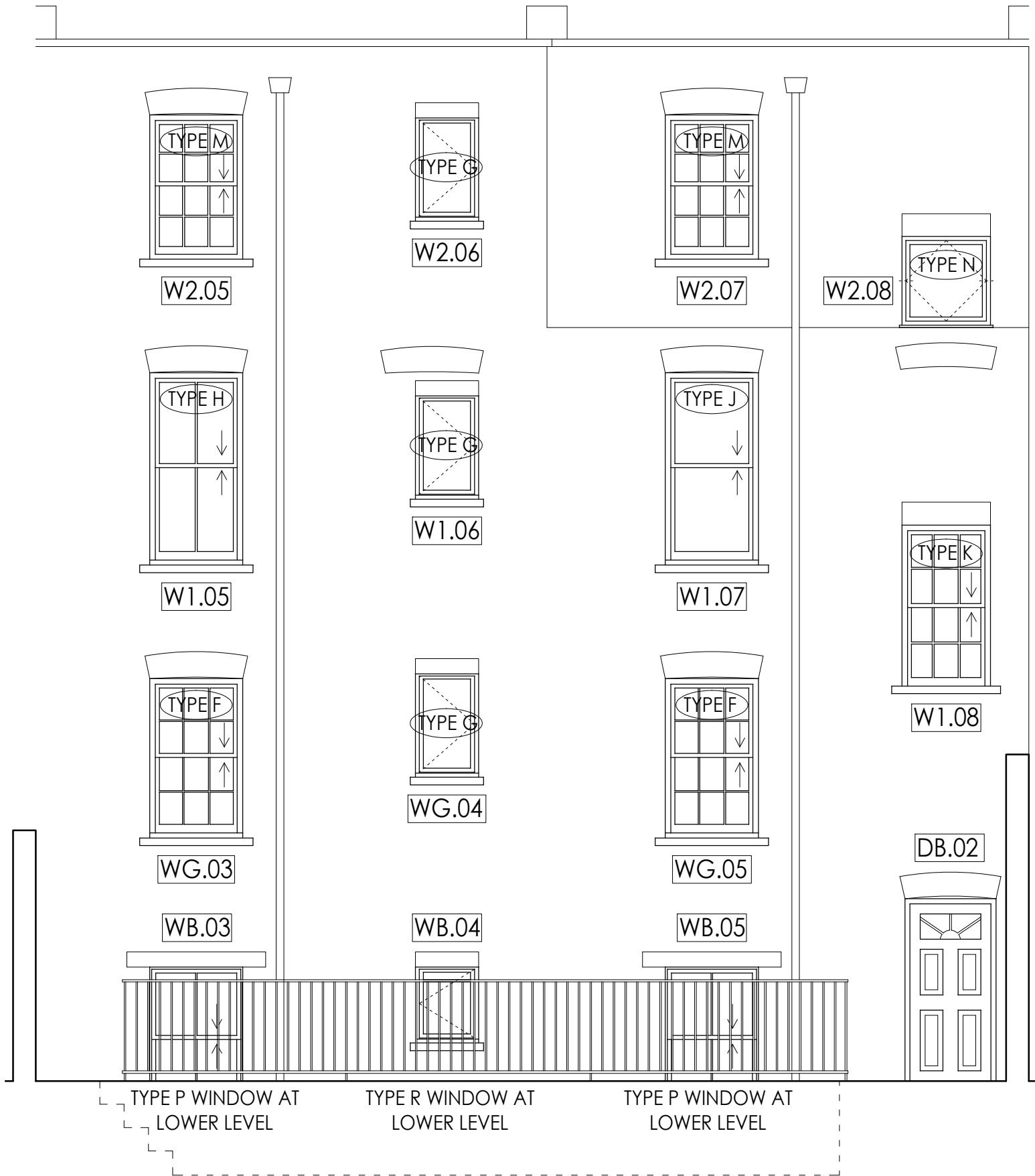
PROPOSED REAR ELEVATION SCALE 1:50 @ A1