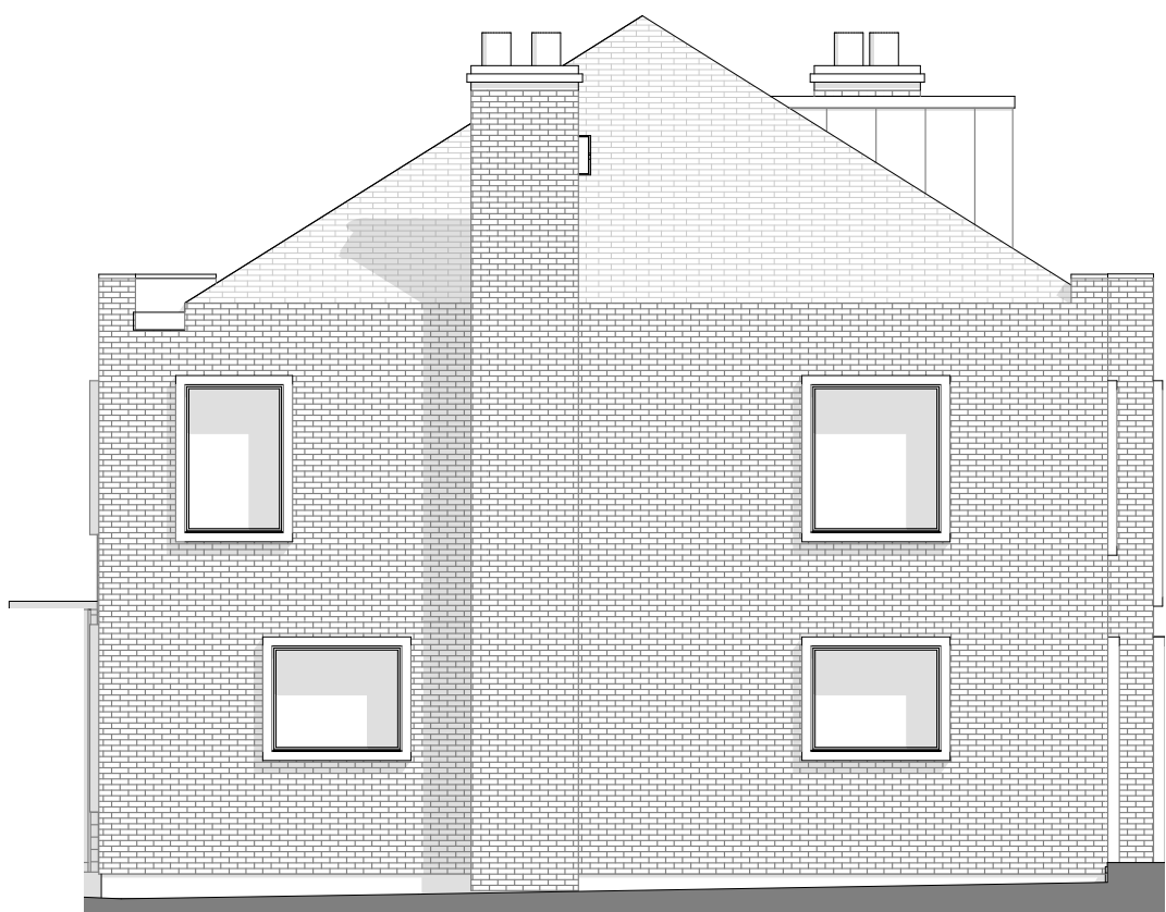
E-04 Side Elevation 02 (West) 1:100