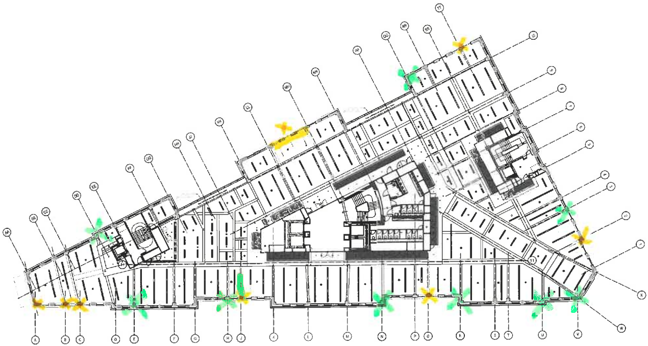
N.B. Lighting layout Indicative only