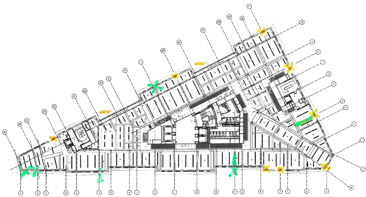
N.B. Lighting layout indicative only