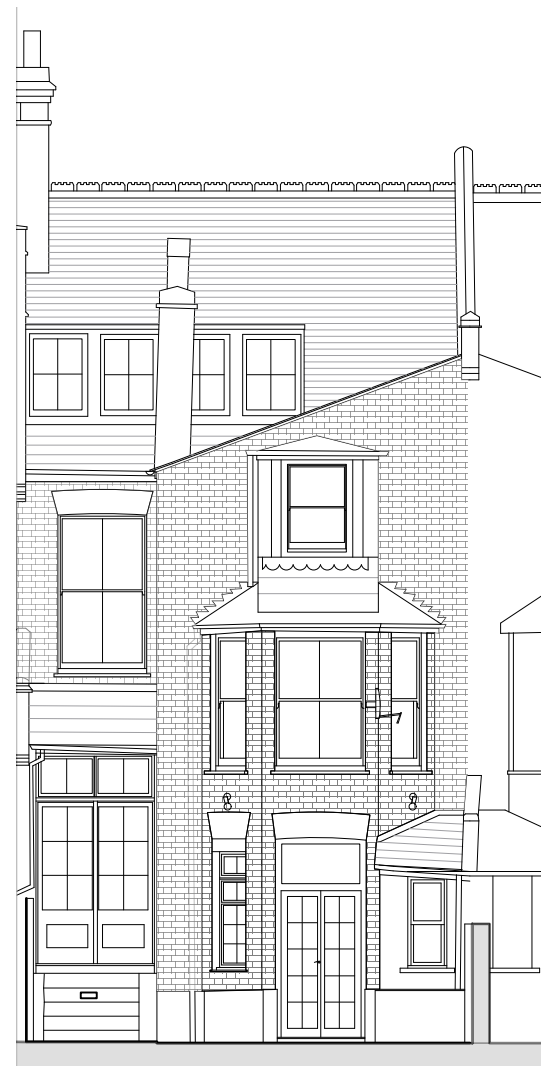
Rear Elevation- Existing