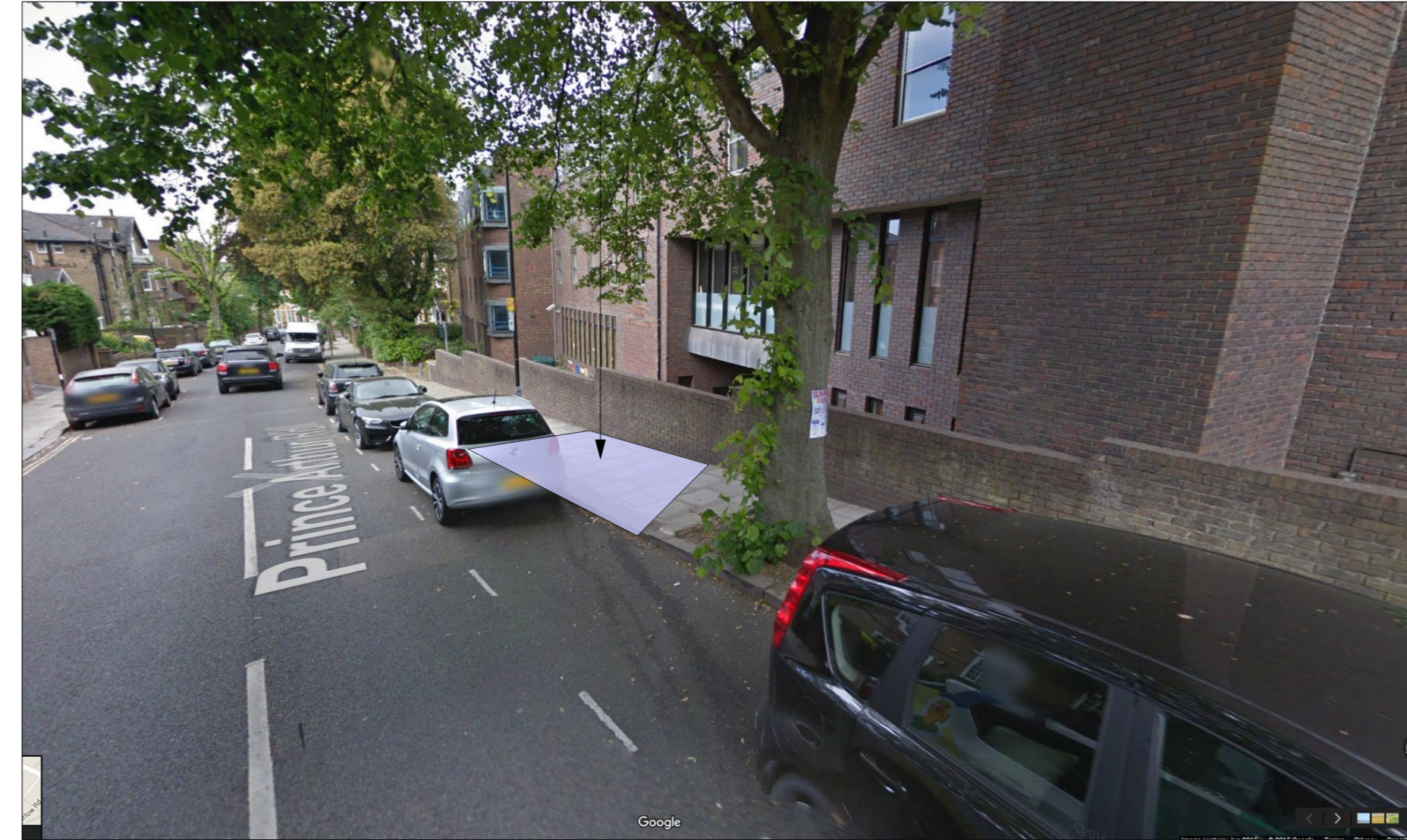
Image Of Existing Autonomis Road Junction - Western Entrance Not To Scale

Existing granite kerbs and paved surfaces to be lowered for vehicular access