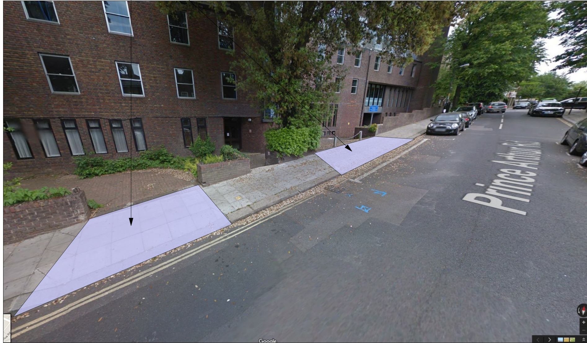
Image Of Existing Autonomis Road Junction - Western Entrance Not To Scale

Existing granite drop kerbs and paved surfaces to be raised flush with existing adjacent kerbs/paving