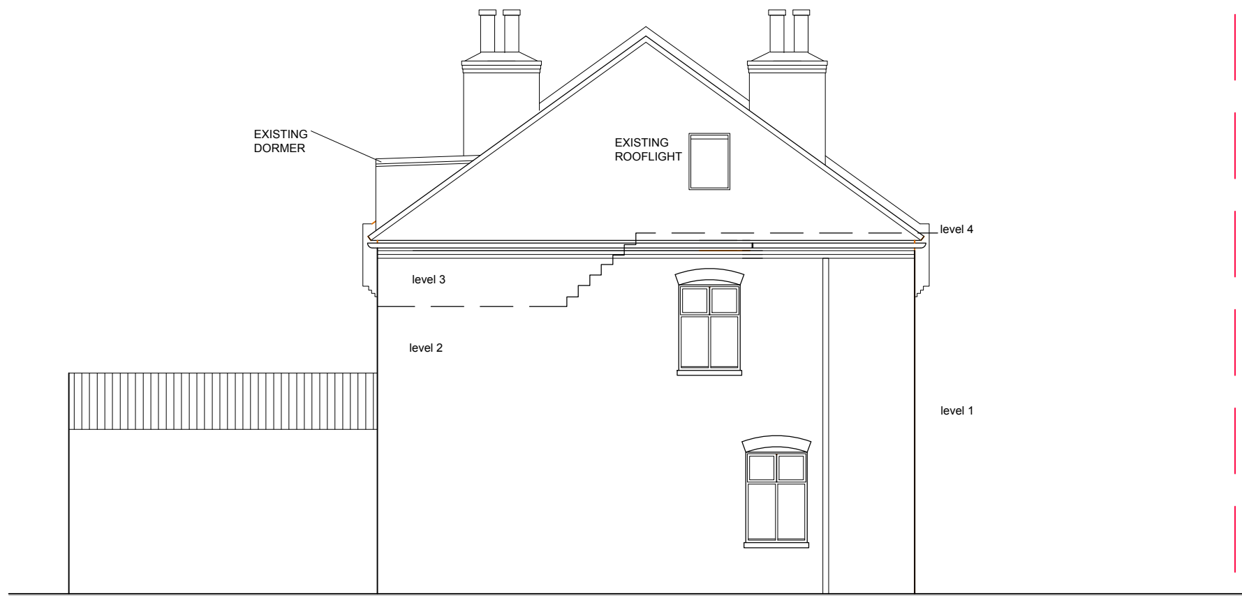
SIDE ELEVATION Scale 1:100@A3