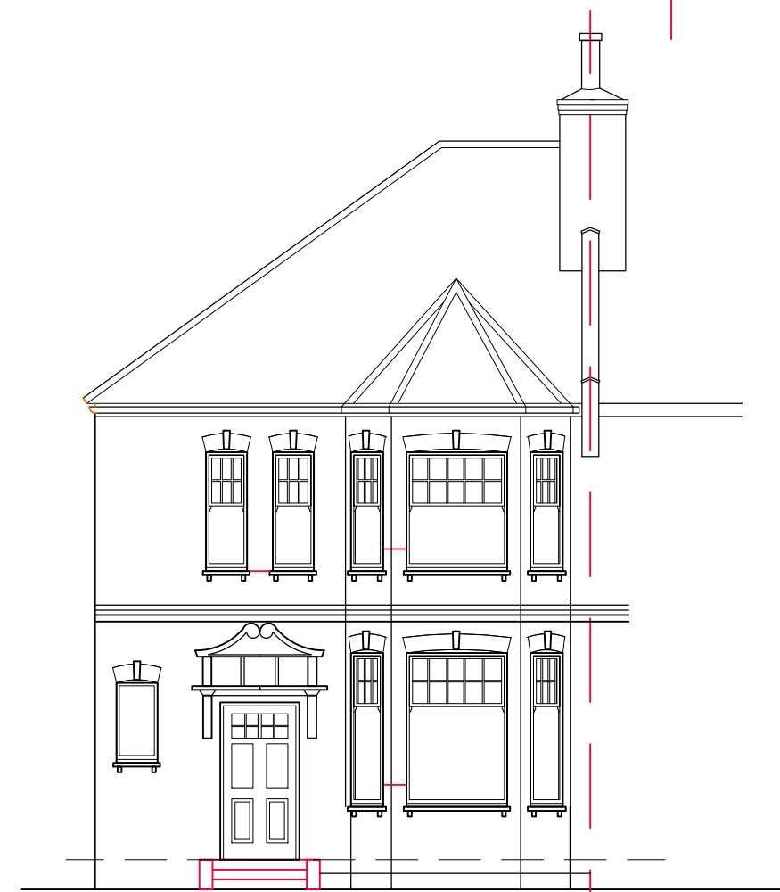
MINSTER ROAD ELEVATION Scale 1:100@A3

status PLANNING client Mr. & Mrs. Goudie site 58 C MINSTER ROAD NW2 DEMISE PLAN drawing EXISTING ELEVATIONS scale 1:100 @ A3 author ncw scale MAY 16 proj. no. N071 drwg. no. P-06 revision A Nicholas C Williams RIBA ncwarchitecture@gmail.com