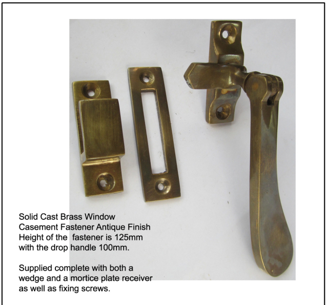
Solid Cast Brass Window Casement Fastener Antique Finish Height of the fastener is 125mm with the drop handle 100mm. Supplied complete with both a wedge and a mortice plate receiver as well as fixing screws.