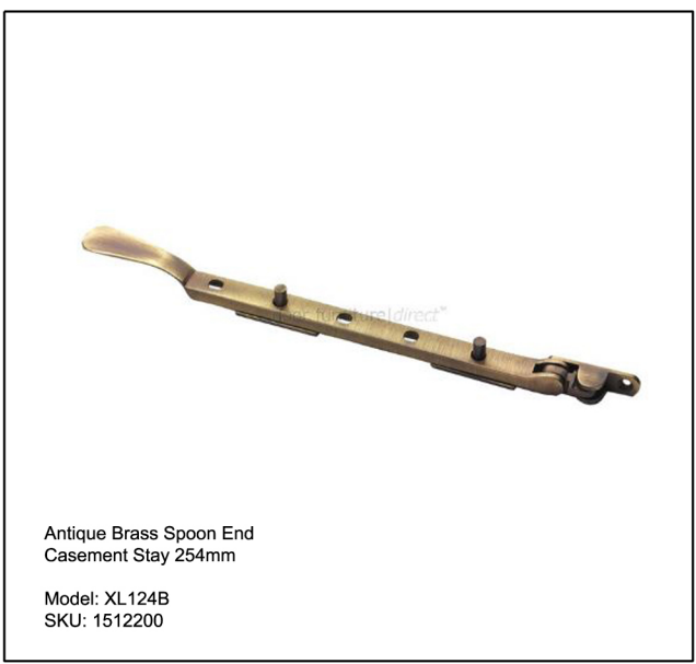
Antique Brass Spoon End Casement Stay 254mm Model: XL124B SKU: 1512200

Windows to be replaced like-for-like white painted timber framed traditional singleglazed casement windows