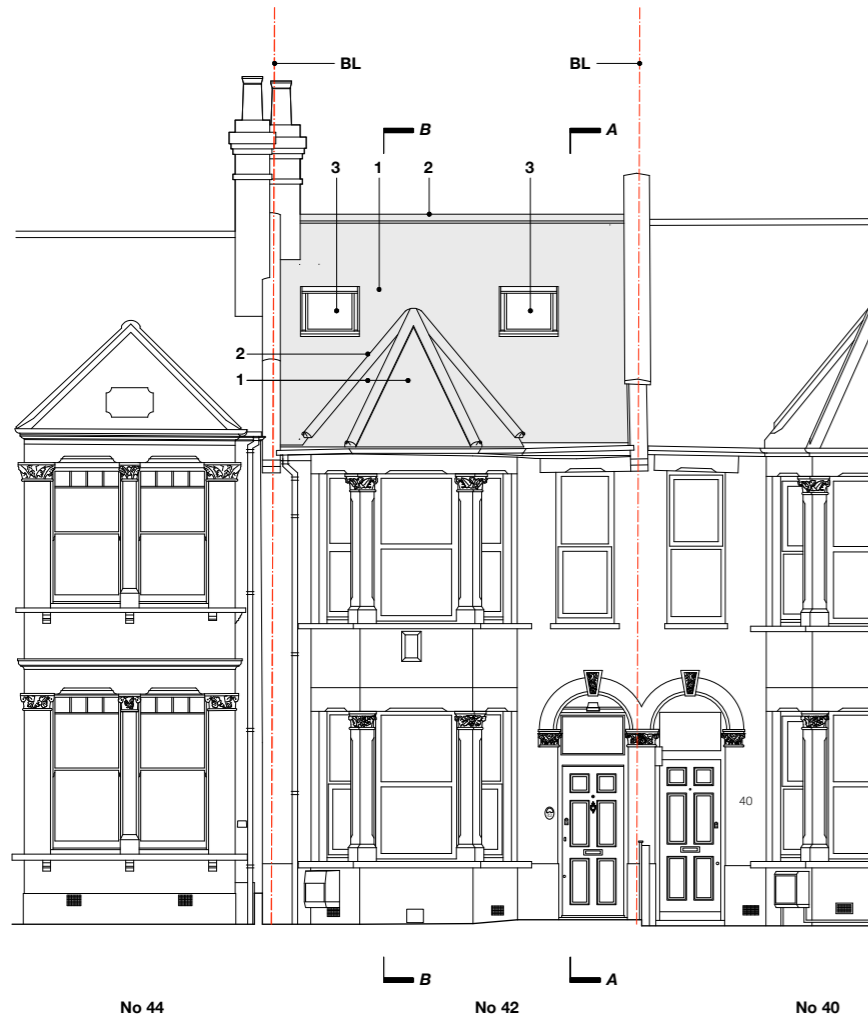
1 PROPOSED SOUTH (STREET) ELEVATION

Rev. revisions REV. P1: 29.05.2016 Existing dormer window and roof shown.