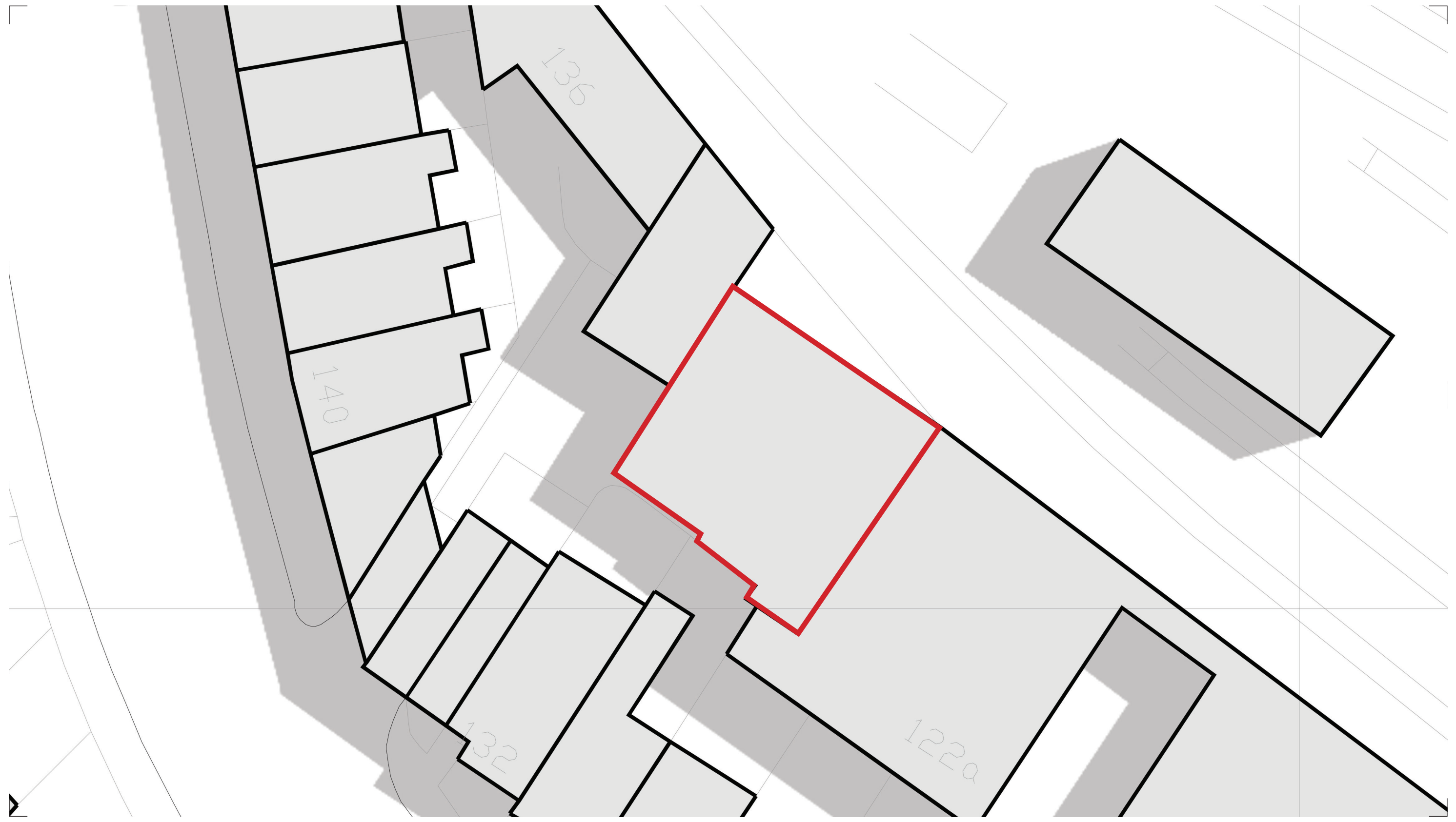
BLOCK PLAN. DRAWING no. 0501. 1:200@A3