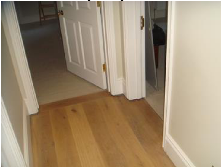
FIGURE 05 Garden flat hallway floor movement.