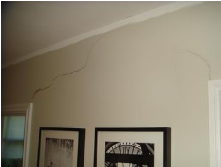
FIGURE 04 Crack damage to the garden flat front left bedroom.