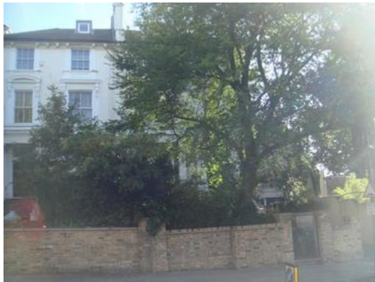
FIGURE 2 Front Elevation