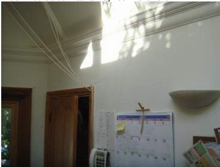
FIGURE 06 Ground floor flat crack damage recorded to the front right kitchen.