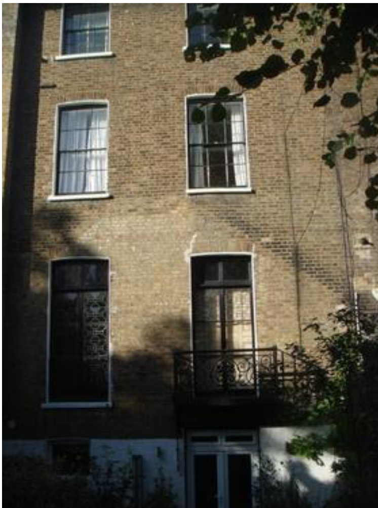
FIGURE 03 Rear Elevation.