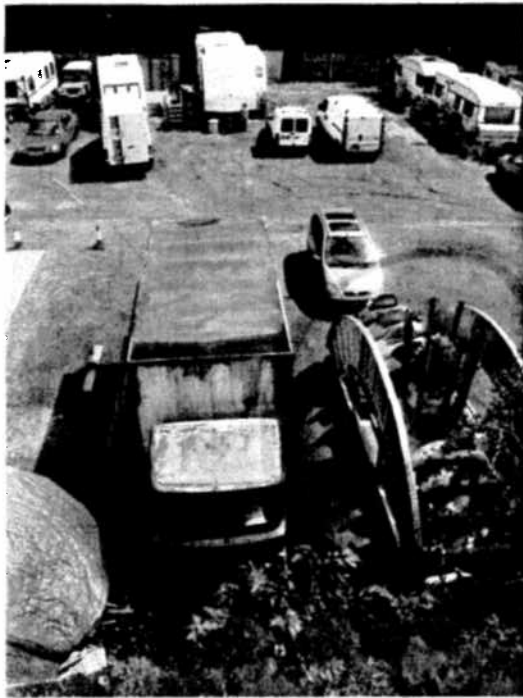
Image 11 July 2010, showing a Fairground ride and old lorry, parked outside 3 & 2 East View