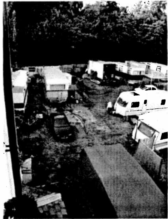
Image 12 July 2010, the storage lorry in the back has been there for many years , detail below