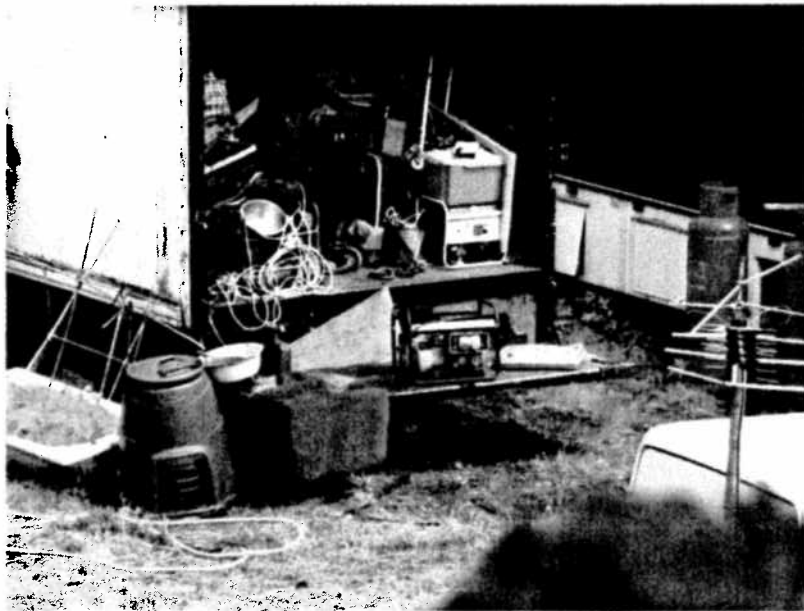
Image 13 July 2010, Storage lorry in between C11 & C12