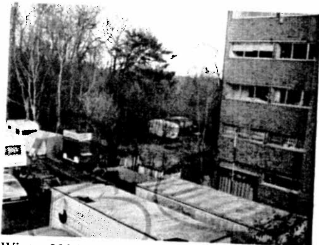
Image 4 Winter 2006, 2 old lorries were located where C01 & C02 are now for many years