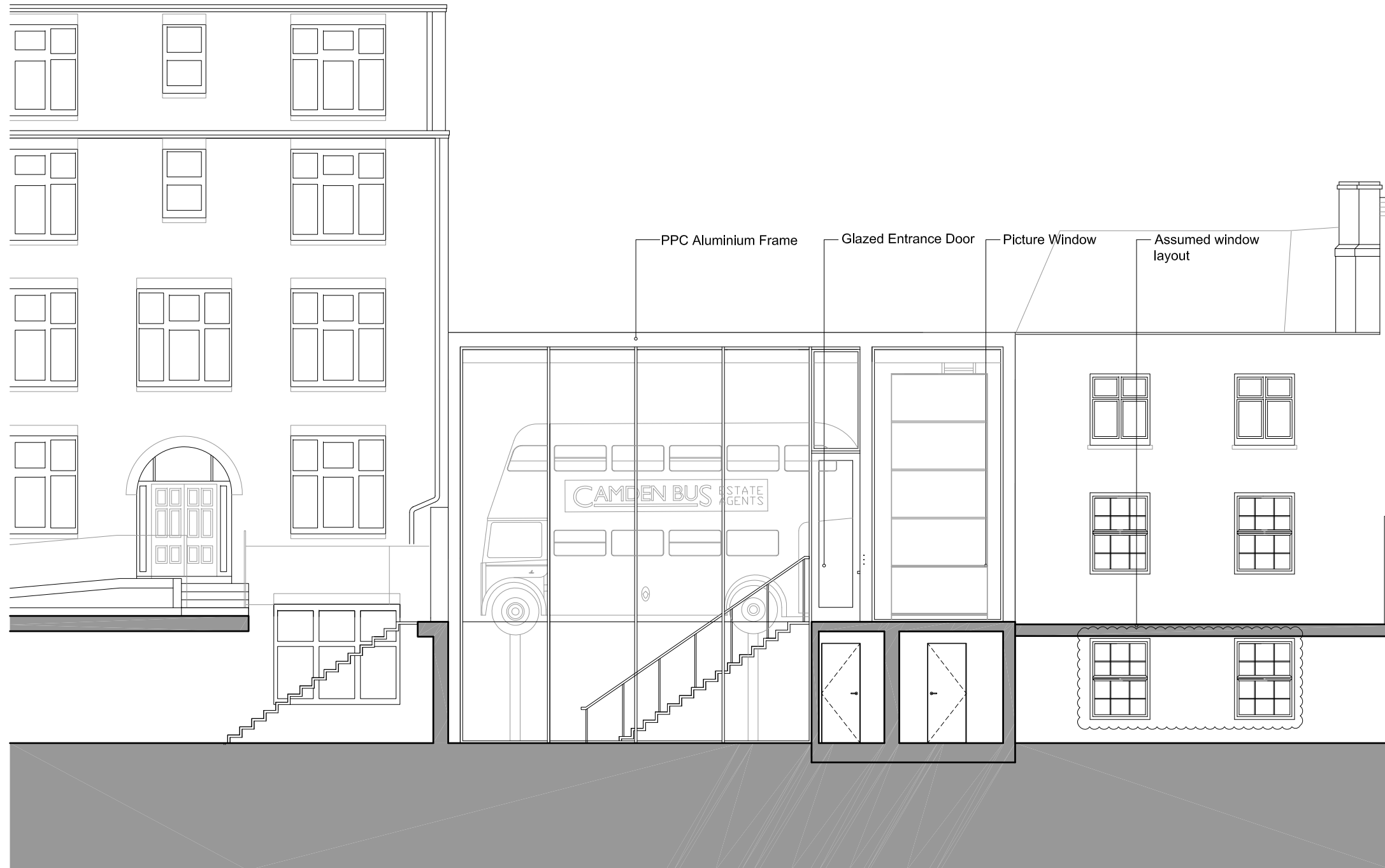
01 Section DD