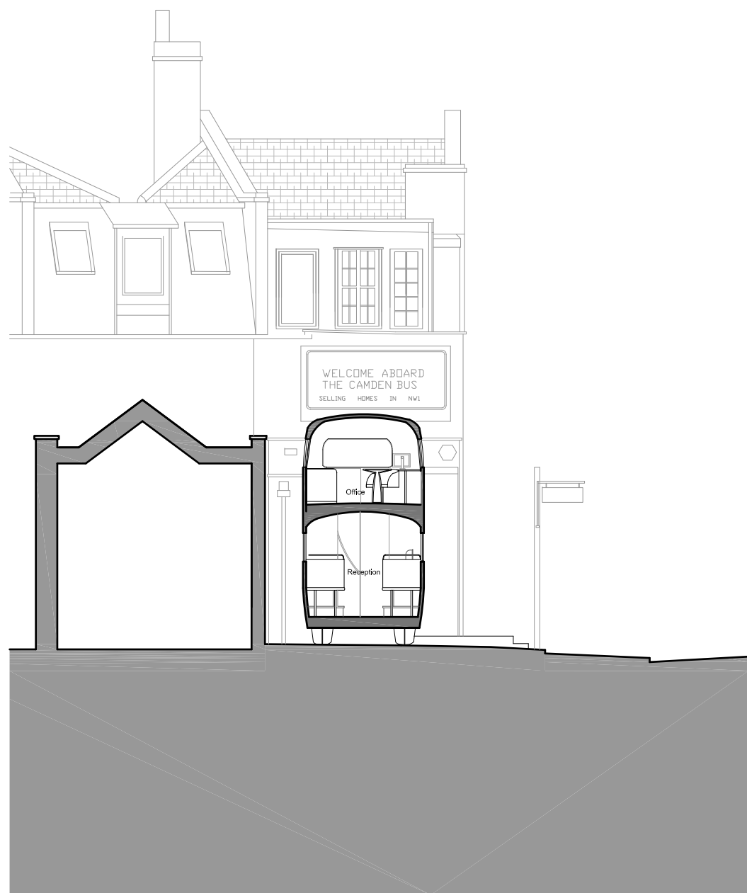
01 Section AA