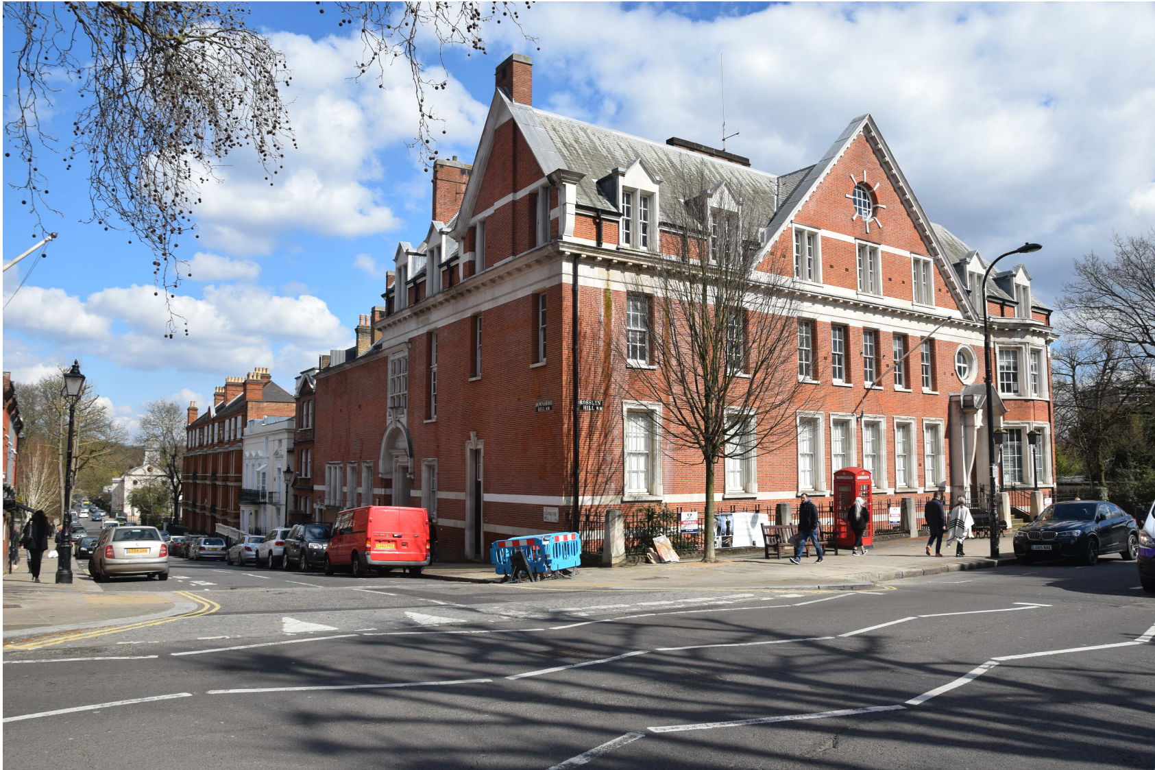
Visual 7: View from Rosslyn Hill remains as existing with the existing building screening the extension from view.