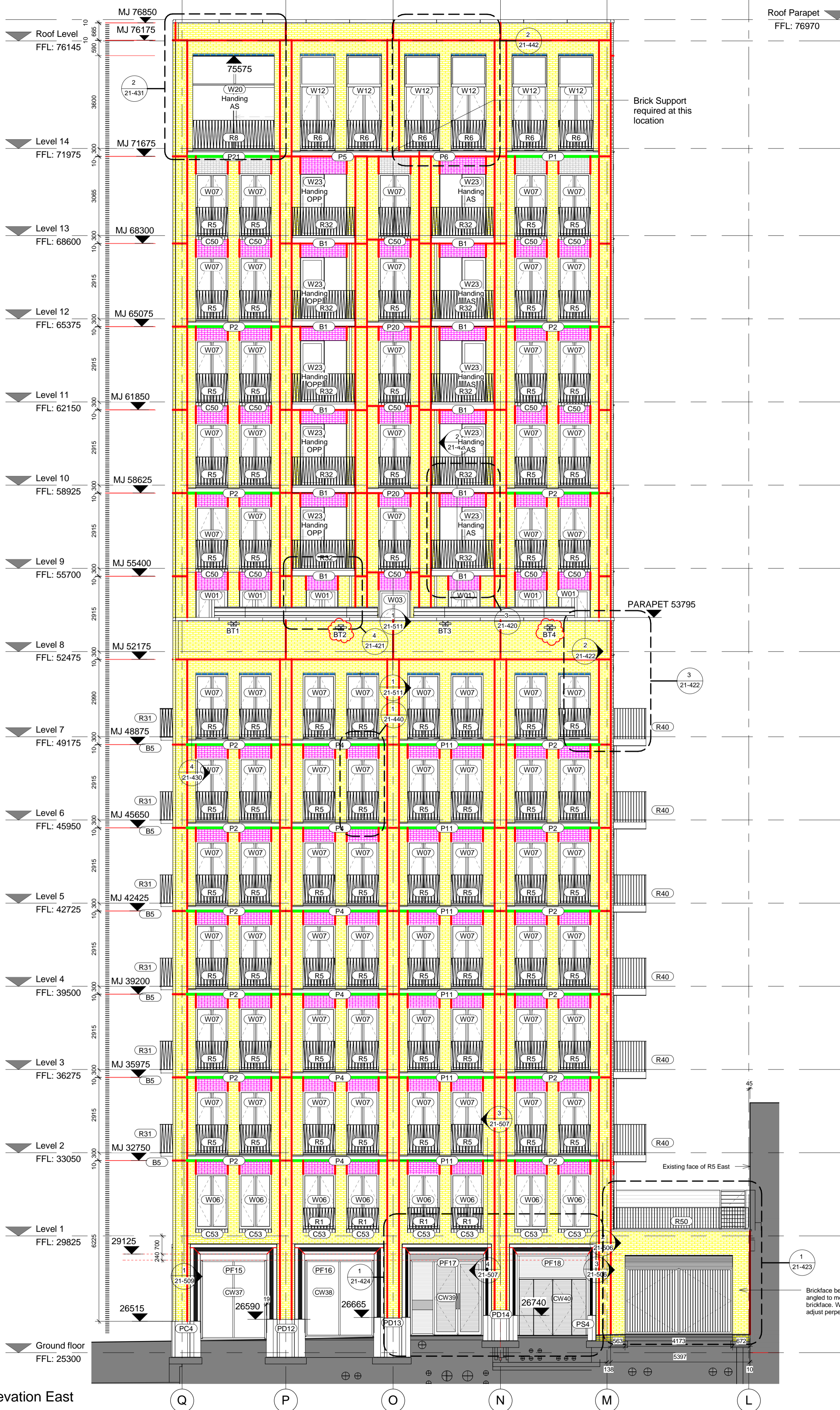
Scoping Elevation East 1 : 100