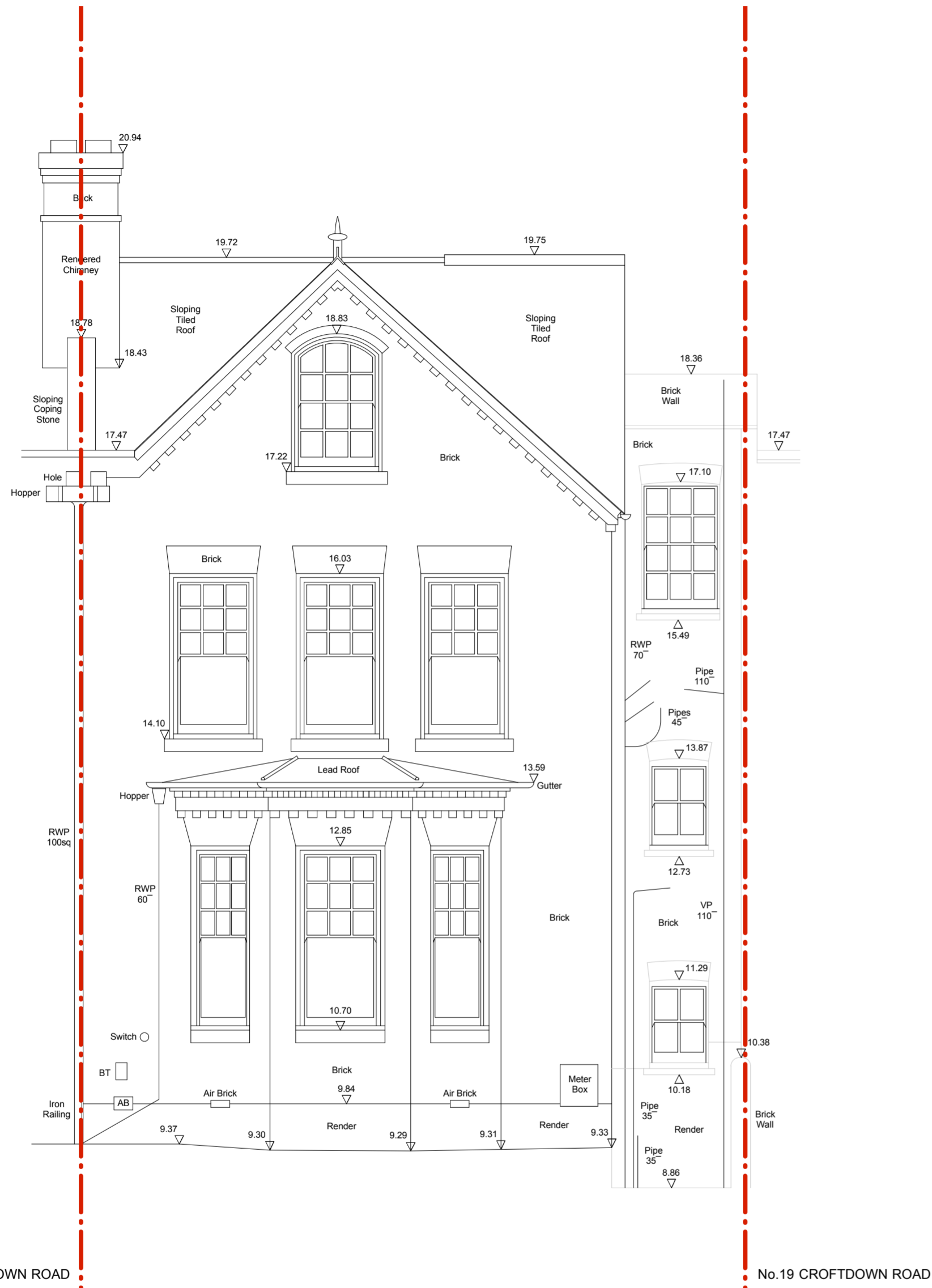
SOUTH FRONT ELEVATION