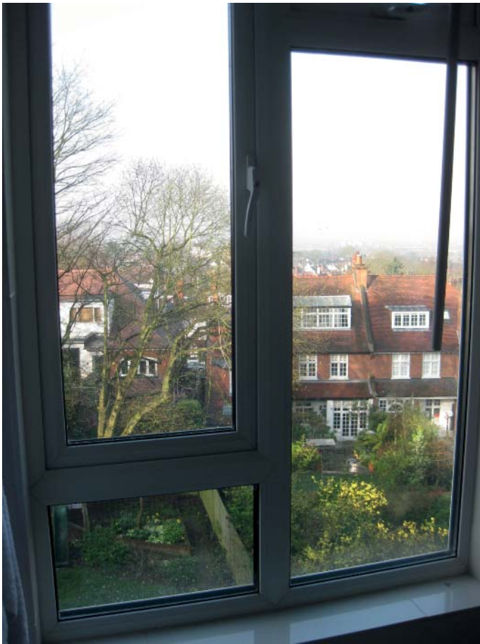
Above : view out of second floor bathroom Below : view of second floor landing with bathroom ahead

Views of the stairwell and window at second floor, view out of the stair window and view of the second floor bathroom and it's rear window.