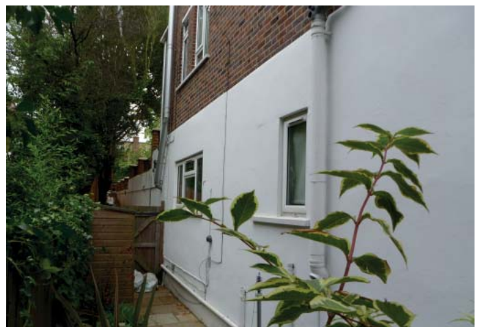
21 Rosecroft Avenue - Existing Photographs