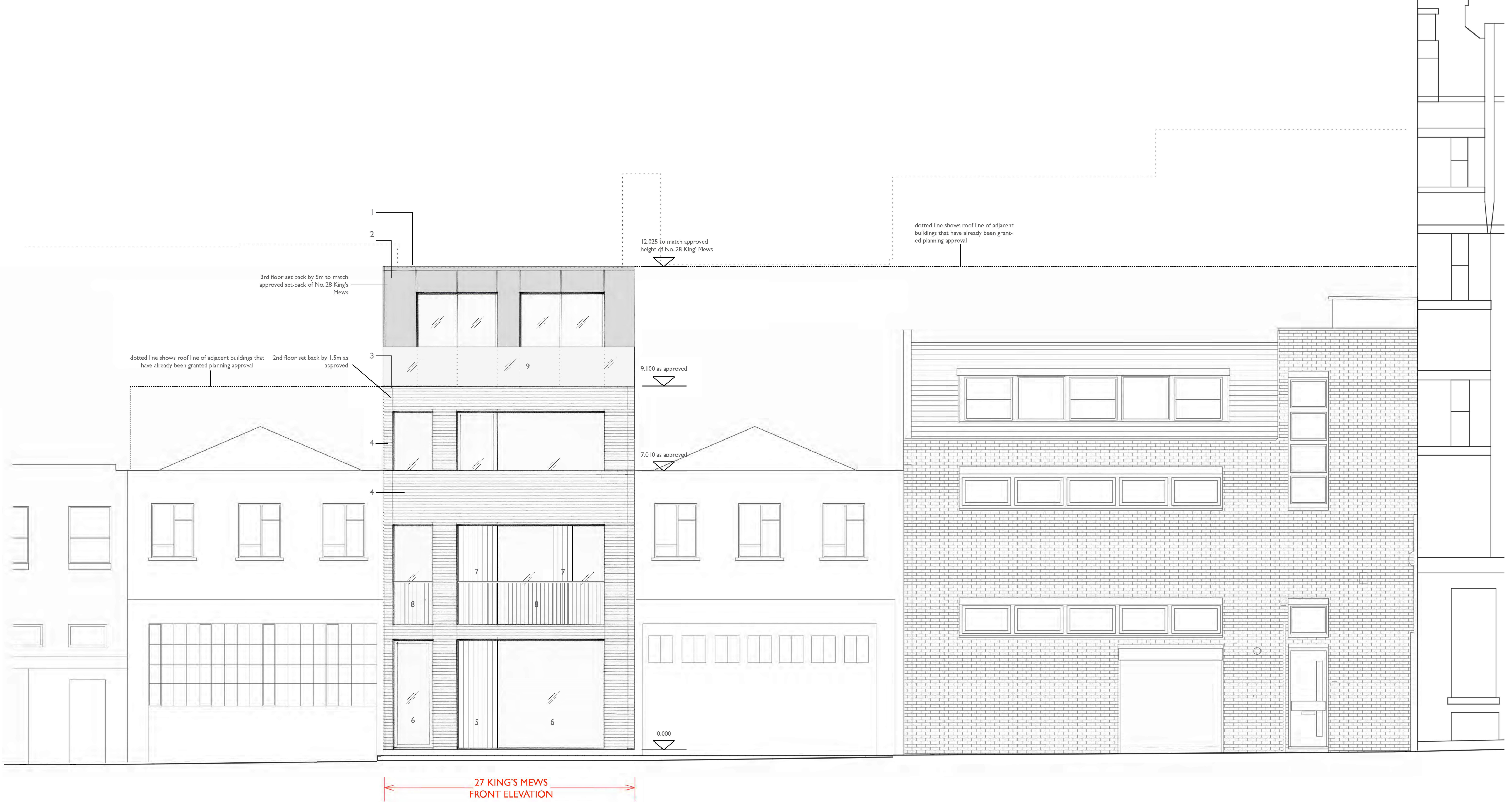
proposed front elevation shown with existing buildings at 25, 26, 28 and 29/30 King's Mews