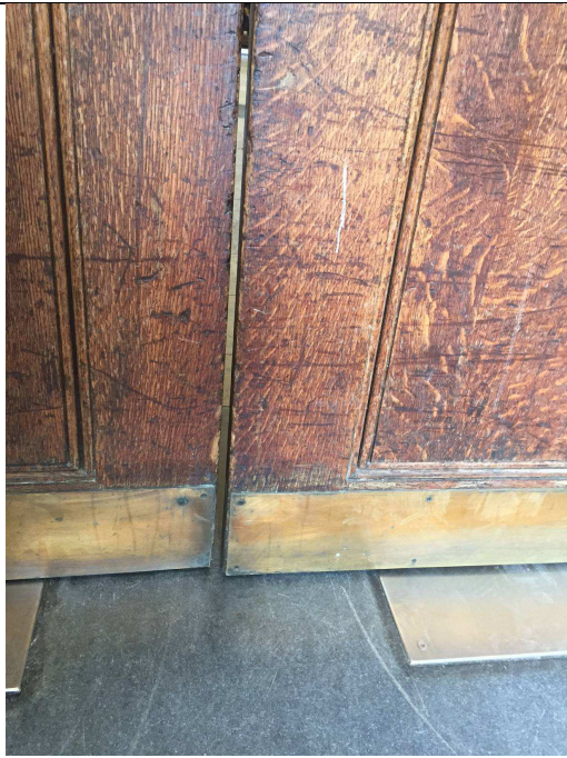
Photo 2: Typical Brass kicker plates and floor embedded door closures.