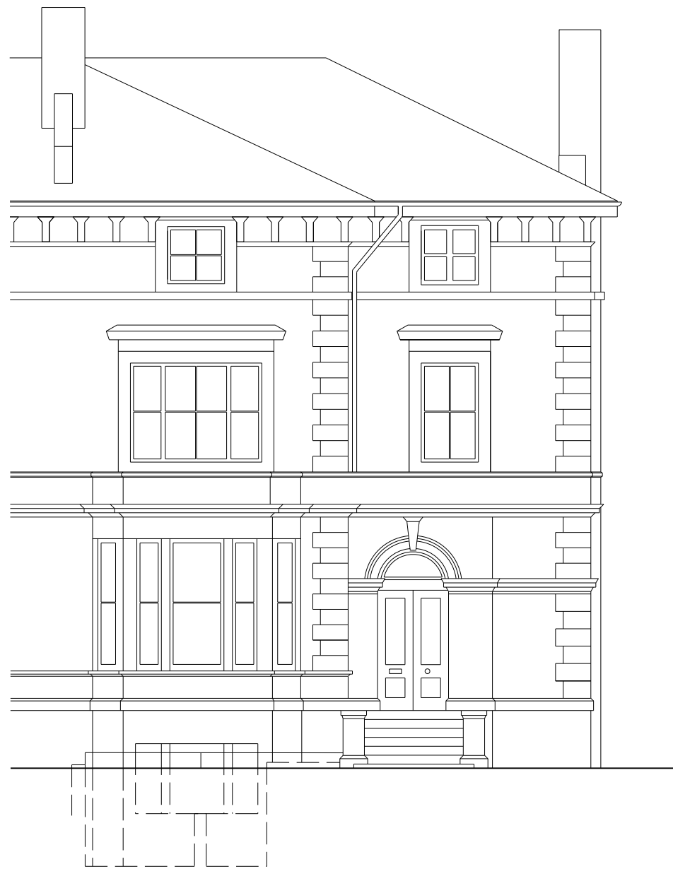
EXISTING FRONT ELEVATION 1:100