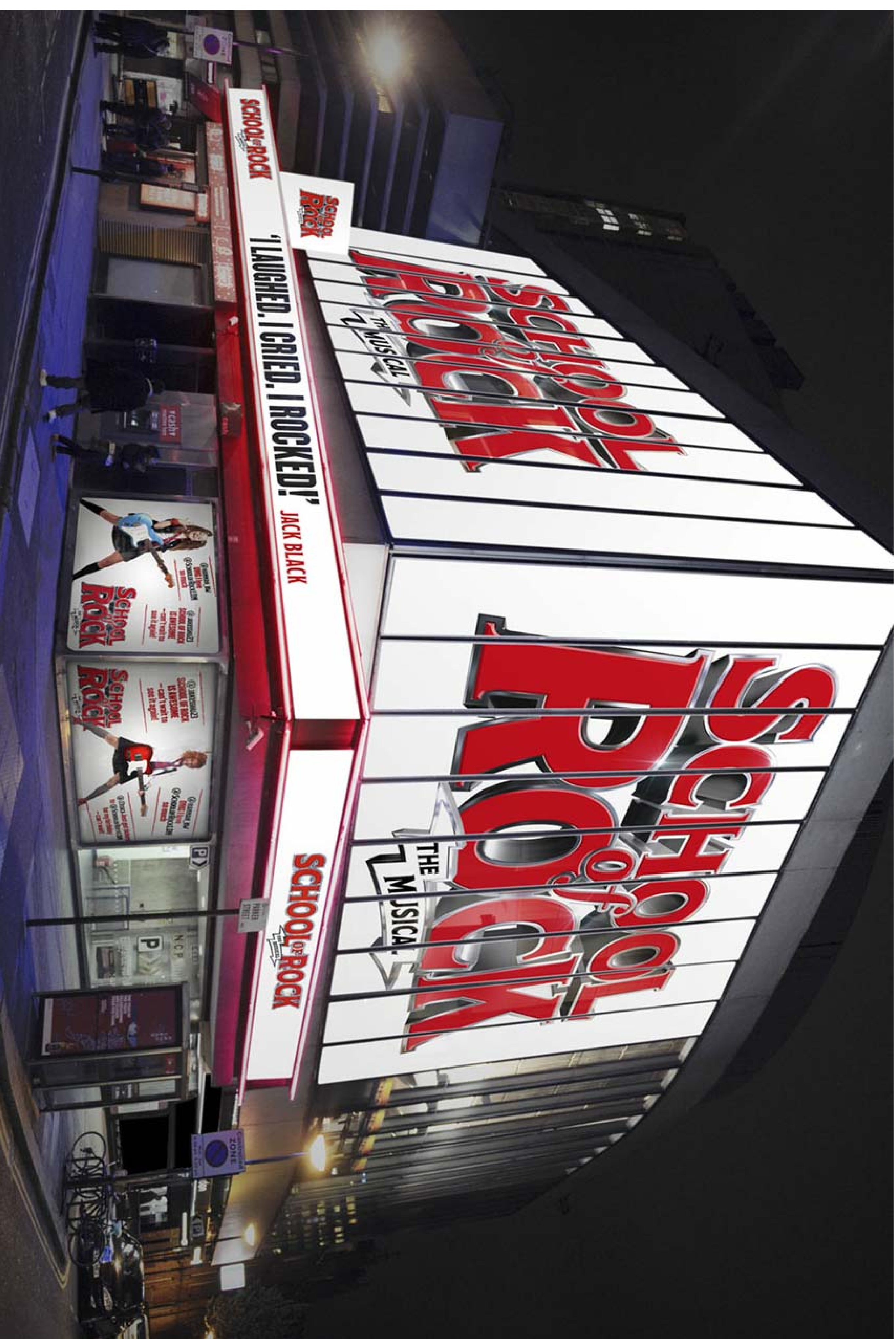
PROPOSED PHOTO ELEVATION (NOT TO SCALE)