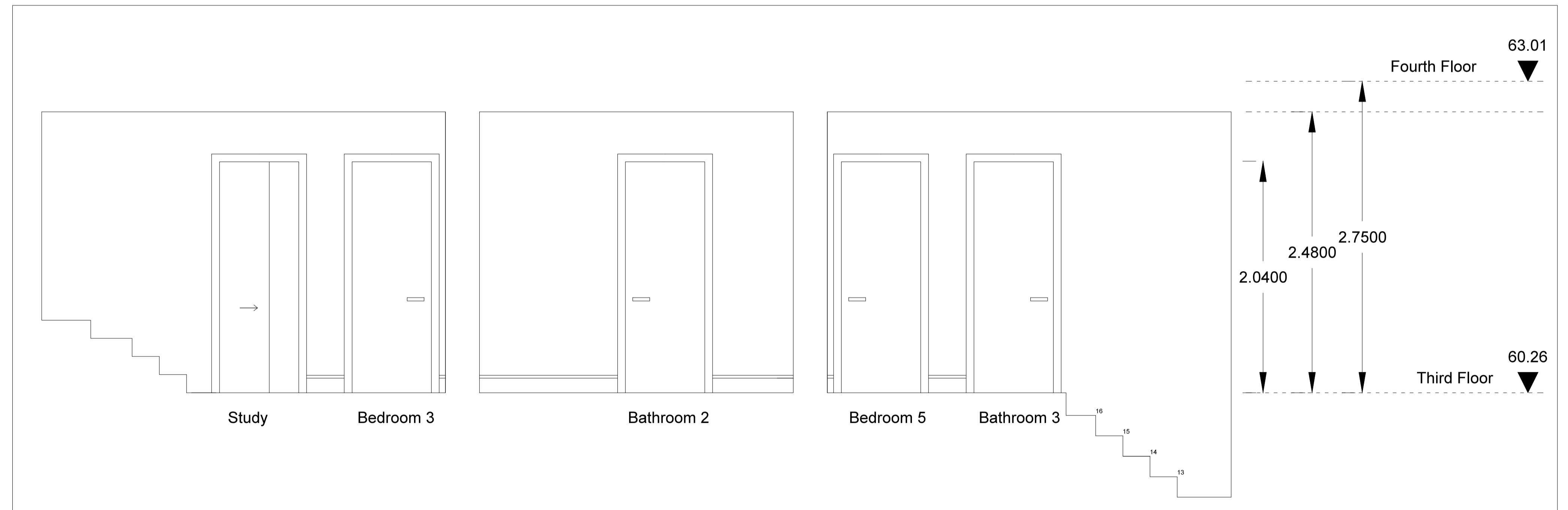
Level 03 Elevations

Project: The Clockhouse, 11 John Street, WC1N 2EB