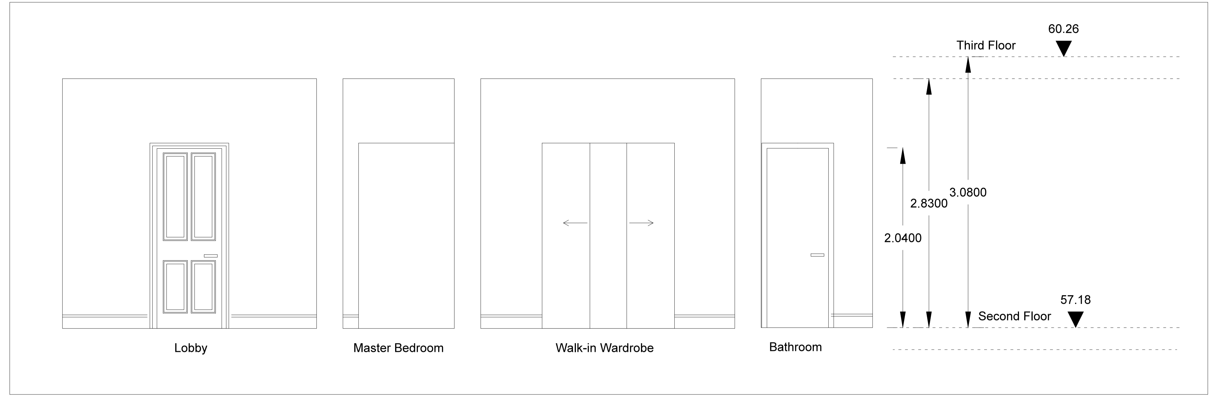
Level 02 Elevations