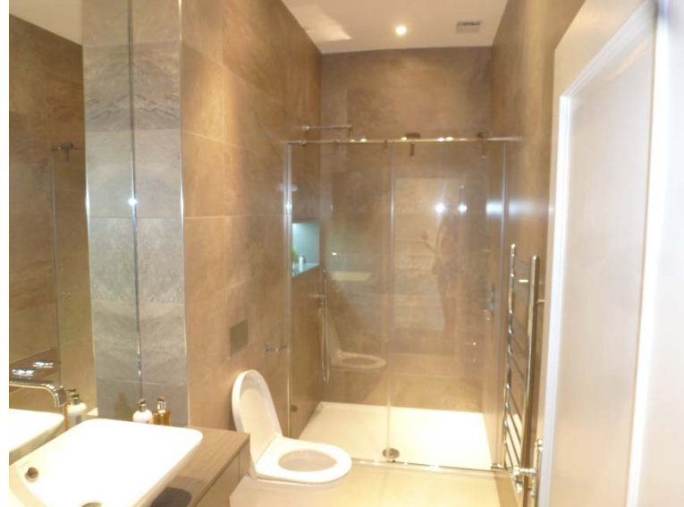
Family Shower Room