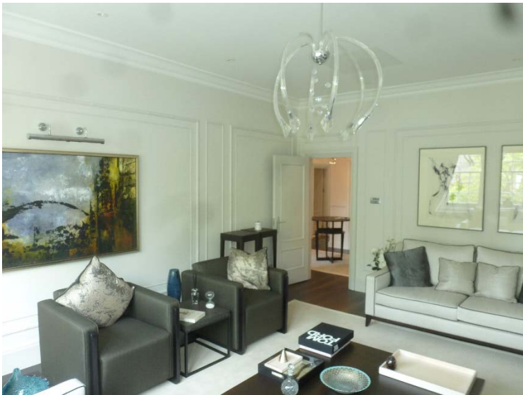
Front Living Room