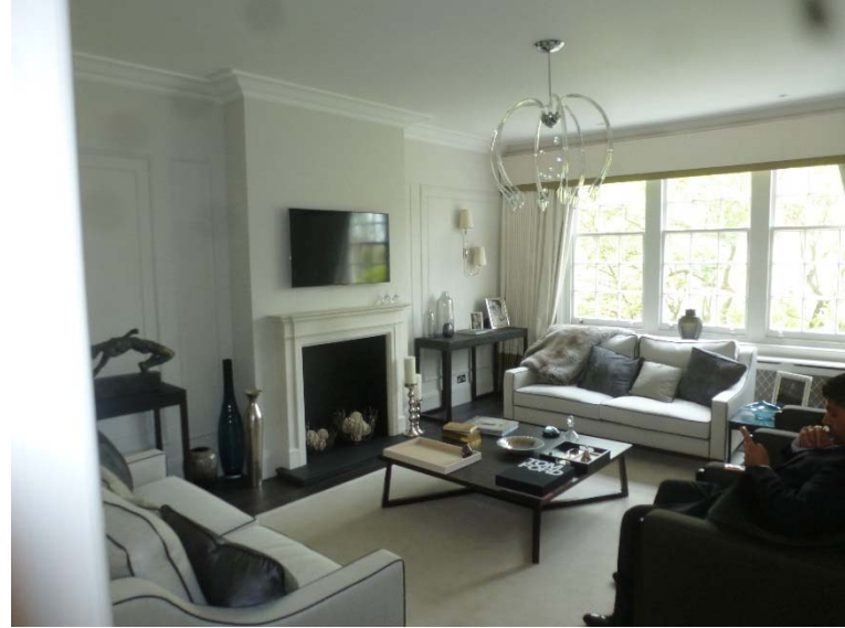
Front Living Room