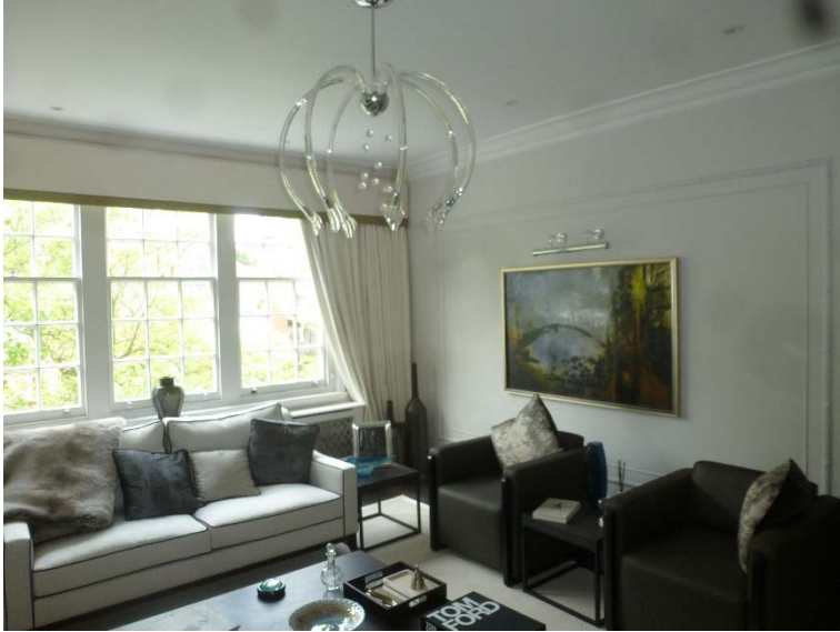
Front Living Room