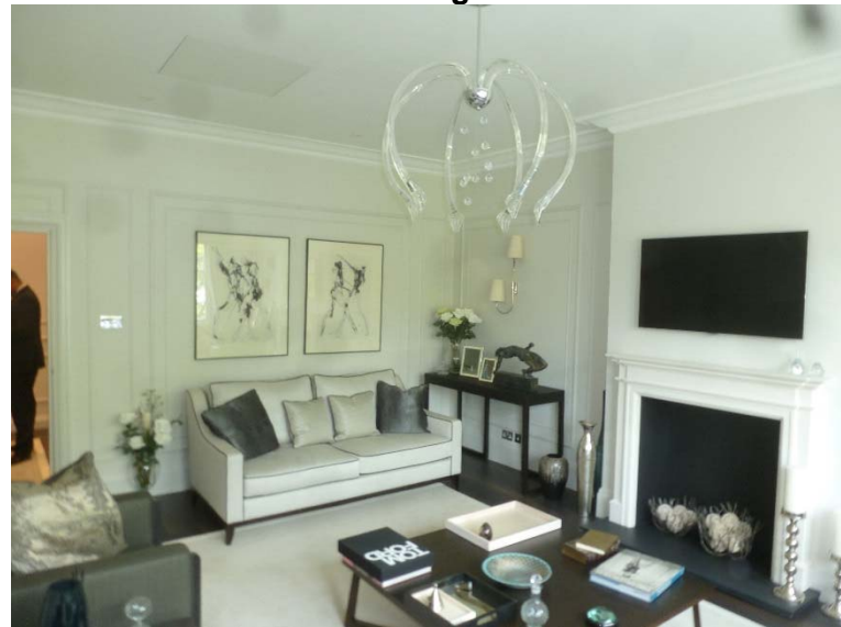
Front Living Room